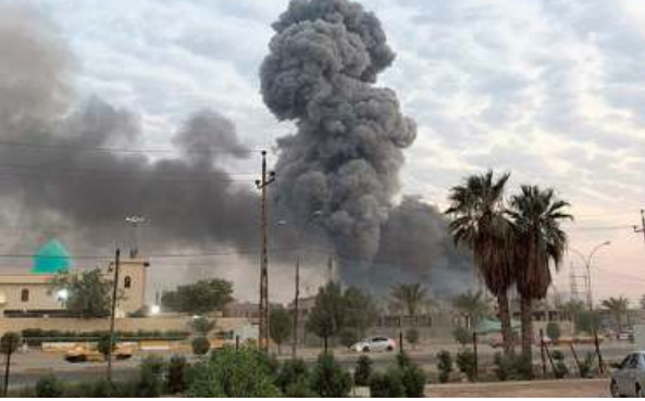
An explosion at a military base in Baghdad.

The Israeli attack last month was one of several recent attacks on weapons storage facilities controlled by Iraqi militias with ties to Iran. It was not clear who