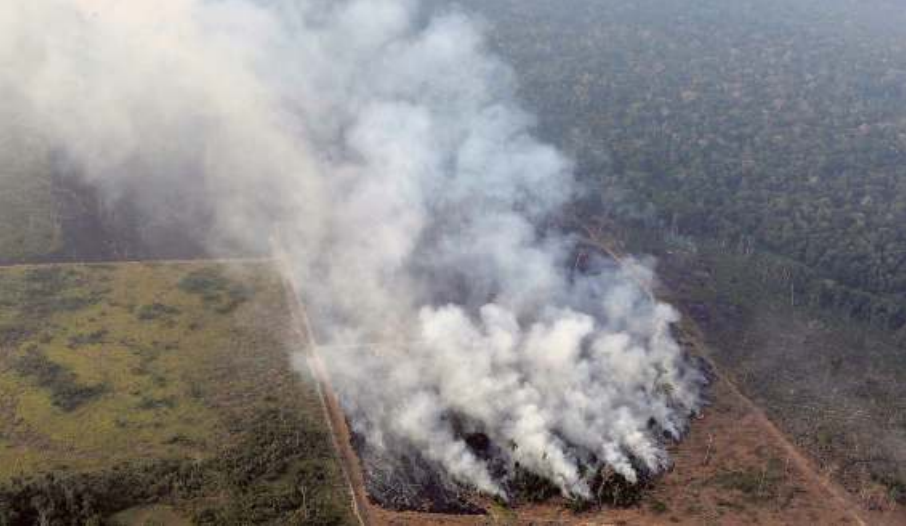
Global concern: Smoke billows from a fire in the Amazon rainforest in Brazil.

The Bolsonaro administration has reacted with indignation to the outrage, claiming without presenting any evidence that NGOs