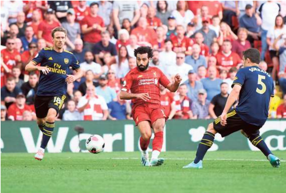
Super finish: Salah left the Arsenal defence for dead to score Liverpool's third.