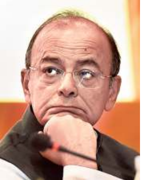
Arun Jaitley.

Former India opener Gautam Gambhir said: "A father teaches u to speak but a father figure teaches u to talk. A father teaches u to walk but a father figure teaches u to march on. A father gives u a name but a father figure