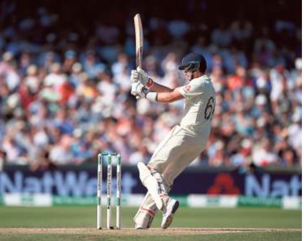
Holding fort: Joe Root, unbeaten on 75 at stumps, is the key to England's chances of pulling off victory.

Earlier, it was a decent start to the morning session for the English bowlers as they picked up the remaining four wickets for 75 runs. Marnus Labuschagne stole the show with a gritty 80 off 187 balls.