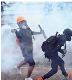
A protester throws a tear gas canister during clashes with police.

The policy was originally proposed by Deng Xiaoping shortly after he took the reins of the country in the late 1970s. Deng’s plan was to unify China and Taiwan under the One Country Two Systems principle. He promised high autonomy to Taiwan. China’s nationalist government, which was defeated in a civil war by the communists in 1949, had exiled to Taiwan. The island has since been run as a separate entity from the mainland China, though Beijing never gave up its claim over Taiwan.