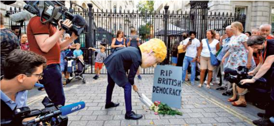
Strong reaction: A man wearing a mask of British Prime Minister Boris Johnson protesting outside Downing Street in London on Wednesday.

Jeremy Corbyn, the leader of the main Opposition Labour Party, has said he wants to call a vote of no-confidence in Mr. Johnson’s government, which commands a majority of just one seat.