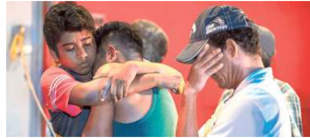
In shock: People breaking down outside the bar, which was set on fire in Mexico on Tuesday night.

The Tuesday night attack, which officials said also left 11 people badly wounded, is the latest to rock the state of Veracruz, a flashpoint in bloody turf wars between