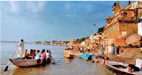
Clean drive: The project aims at identifying contaminants in the river and the threat to human health.

The government has commissioned a ₹9.3 crore study to assess the microbial diversity along the entire length of the Ganga and test if stretches of the 2,500 km long river contain microbes that may promote "antibiotic resistance".