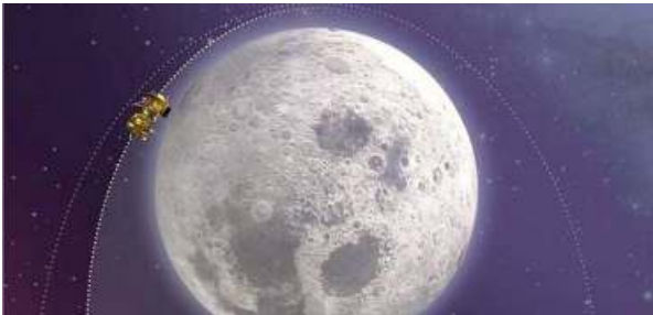
On track: Chandrayaan-2 completed an action lasting nearly 20 minutes to bring the spacecraft closer to the Moon.

Chandrayaan-2 narrowed its distance from the Moon after a manoeuvre on Wednesday morning. The Indian Space Research Organisation (ISRO) said it completed the third orbit action lasting nearly 20 minutes to bring the spacecraft closer to the Moon. It was done from the Mission Operations Complex at ISTRAC in Bengaluru.