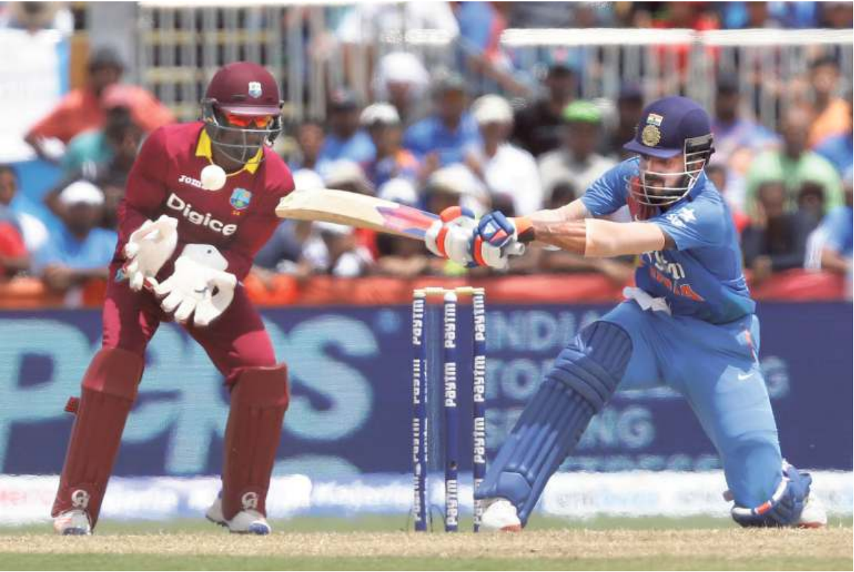
Sweet memories: Rahul will look forward to Saturday’s outing as he scored an unbeaten 110 in his last innings at the venue.

“Currently, I’m associated with too many things – IPL, CAB, TV commentary. Let me complete this. But I will definitely put my hat into the ring at some stage,” Ganguly said.