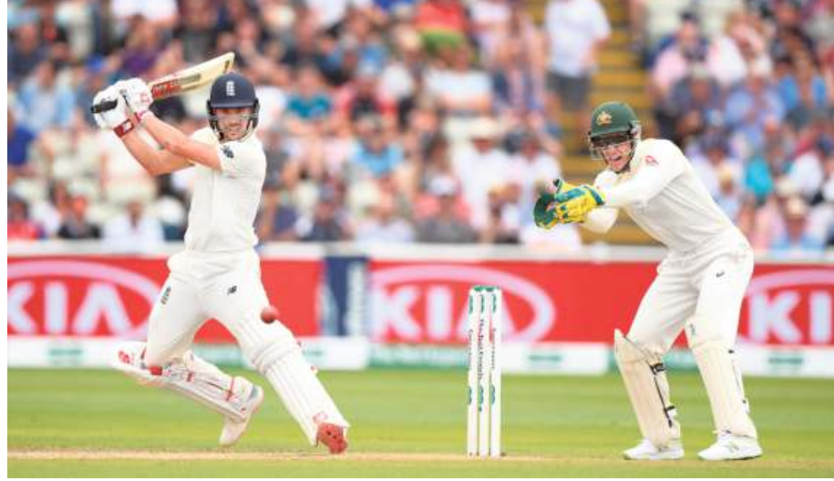
Rory’s day out: Burns was solid in defence and assured in strokeplay.

Skipper Joe Root had returned to No. 3 in a bid to lead from the front.