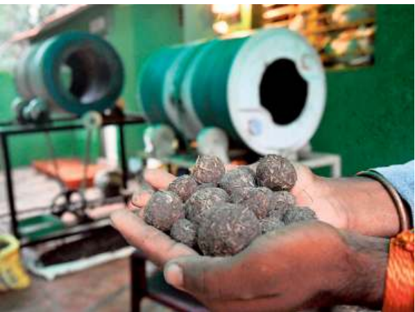
Seed capital: A forest employee making seed balls at the Ahmaddpur Forest Nursery in Bhopal.

money and this is eventually transferred to the States concerned to carry out afforestation. Only a fraction of this corpus had actually been disbursed to States, due to the lack of a legal framework and instances of States using it for non-forestry purposes. Independent authority The CAF Act 2016, which came into being more than a decade since it was devised, established an independent authority – the Compensatory Afforestation Fund Management and Planning Authority – to execute the fund. However, it was not until last August that the rules governing the management of the fund were finalised. Environment Minister Prakash Javadekar, while presenting cheques to senior