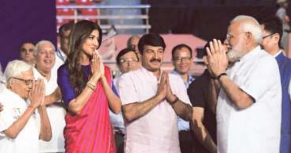
Towards fitness: Narendra Modi during the launch of ‘Fit India Movement’. Actor Shilpa Shetty was also present.

SPECIAL CORRESPONDENT NEW DELHI Launching the ‘Fit India Movement,’ Prime Minister Narendra Modi on Thursday said healthy individuals, families and society would be the ones to make ‘new India,’ “fit India” and urged people to make fitness their lifestyle. Marking the National Sports Day on the birth anniversary of hockey legend Major Dhyan Chand, Mr. Modi launched the “people’s movement” for promoting fitness, a government statement said. The PM also congratulated sportspersons who had