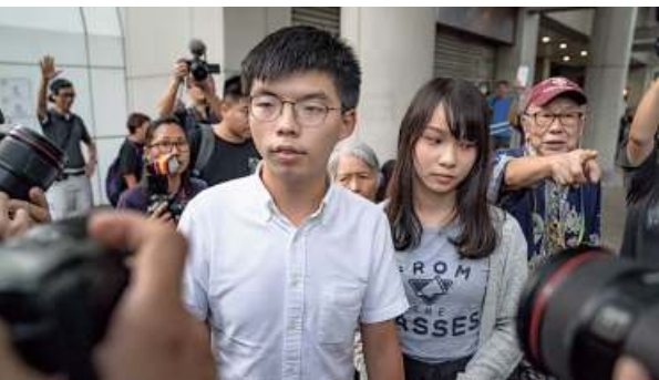
Pressure tactics: Activists Joshua Wong and Agnes Chow, right, after getting bail in Hong Kong.

of force a day before the fifth anniversary of China’s decision to rule out universal suffrage in the former British colony. The bespectacled Mr. Wong, who was 17 when he became the face of the student-led Umbrella Movement, as the 2014 pro-democracy protests were called, has not been a prominent figure in the latest protests, which have no identifiable leaders. He was released from jail in June after serving a five-week term for contempt of court. Mr. Wong and fellow activist Agnes Chow were charged with unlawfully organising a public meeting outside police headquarters on June 21. They were re-