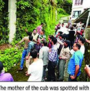
The mother of the cub was spotted with the carcass of the early morning but it ran away when a crowd gathered

Amol Lata / IANS Mussoorie: A leopard cub was found dead on Saral Road, about 100 metres away from Mussoorie's iconic Mall Road on Saturday morning. On information, forest officials rushed to the spot and recovered the carcass before sending it, for postmortem. They said that the cub is believed to be around a month-old even though the cause of death is yet to be ascertained.