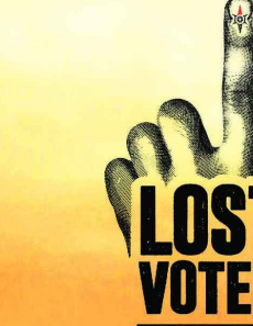
An initiative of The Times of India