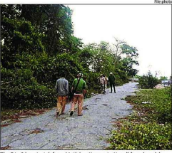
The 7 to 8 km stretch from Motichur Kanroli to Nepal farm is a risky one due to a sizeable leopard population