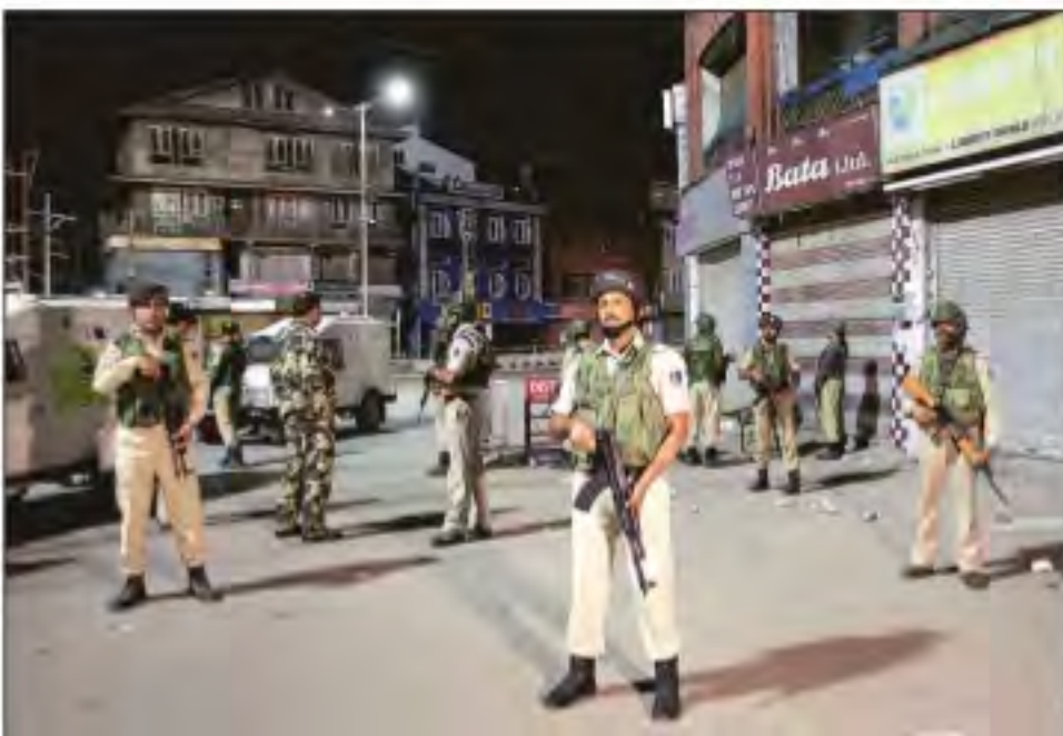
Forces out on Srinagar streets on Sunday night.

Govt looks at land laws to dilute Art 35A