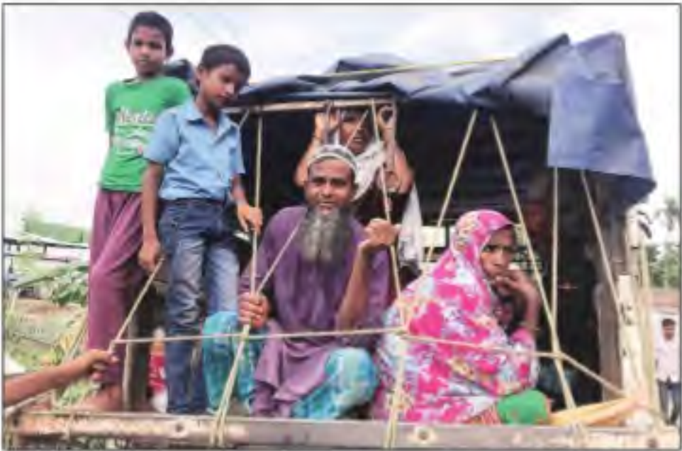
At Sontoli, one of the trucks hired for hearings. Abhishek Saha

boarded was hired for Rs 30,000 by those served notices in their village. Other families were seen clambering onto Tata Sumos and pick-up trucks, headed apart from Jorhat, for towns like Dibrugarh, Sivasagar and Golaghat.