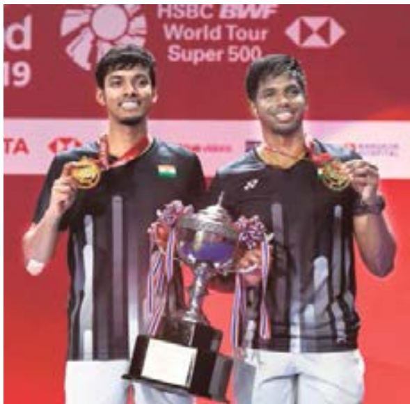
A day to remember: Chirag Shetty, left, and Satwiksairaj Rankireddy inked their names in bold in Indian badminton history.

They won India's first-ever men's doubles final at the Thailand Open badminton championship