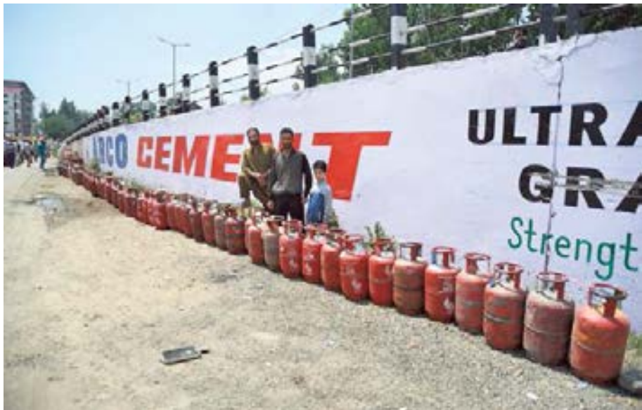
Running on empty: People with gas cylinders waiting for refills in front of an outlet in Srinagar on Sunday.

In a phased manner, mobile Internet services were snapped in all districts of the