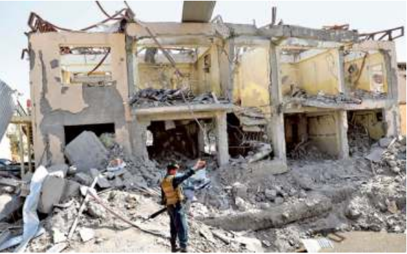
Mayhem continues: An Afghan police officer inspecting the site of a blast in Kabul on Wednesday.

The Afghan Interior Ministry said the explosion was caused by a car bomb, but the Taliban, which claimed the attack, said it was a much larger truck bomb. An