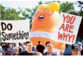
Protesters outside the Miami Valley Hospital in Ohio.

Crowds of protesters outside the hospital set up a “baby Trump” blimp balloon, chanted “Do Something!” and held signs reading