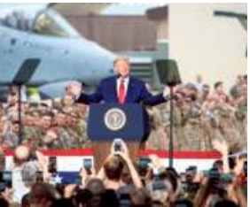
Donald Trump addressing U.S. troops in Osan Air Base on June 30.

South Korea and the U.S. in March signed a deal to increase Seoul’s payments for