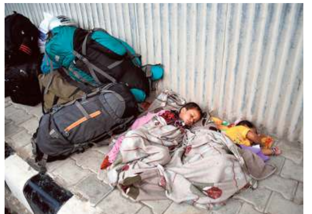
Stranded on the street: Children sleeping on a pavement outside the Tourist Reception Centre in Srinagar as their parents make efforts to leave the Valley.