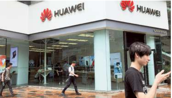
The U.S. unveiled rules banning Huawei and other Chinese technology firms from government contracts.

China on Thursday denounced rules unveiled by the U.S. that ban technology giant Huawei and other Chinese firms from government contracts as "abuse of state power" in the latest move in the escalating China-U.S. trade war. The interim rule, which will preclude any U.S. federal agency from purchasing telecom or technology equipment from the firms, is part of efforts by Washington to restrict Huawei, which officials claim is linked to Chinese intelligence. "The abuse of state power