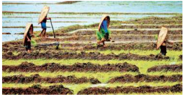
Time to act: A particular danger is that food crises could develop on several continents at once.

The world's land and water resources are being exploited at "unprecedented rates", a new UN report warns, which, combined with climate change, is putting dire pressure on the ability of humanity to feed itself. The report, prepared by more than 100 experts from 52 countries and released in summary form in Geneva on Thursday, found that the window to address the threat is closing rapidly. Half a billion people live in places that are turning into desert, and soil is being lost between 10 and 100 times faster than it is forming, according to the report. Climate change will make those threats even worse, as