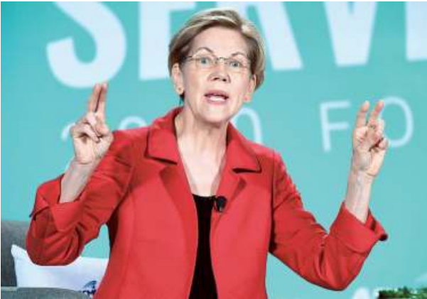
In attack mode: U.S. Senator Elizabeth Warren speaking at the 2020 Public Service Forum in Las Vegas.

Asked in a brief interview with The New York Times if she thought Mr. Trump was a white supremacist, Ms. Warren responded without hesitation: "Yes." "He has given aid and comfort to white supremacists," Ms. Warren said during a campaign swing in western Iowa. "He's done the wink and a nod. He has talked about white supremacists as fine people. He's done everything he can to