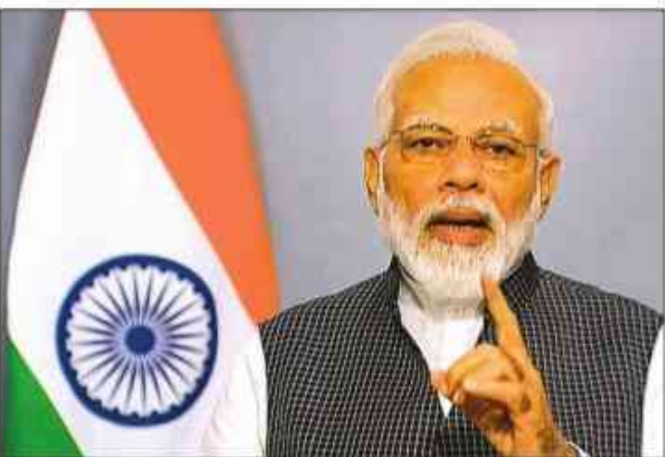
Prime Minister Narendra Modi during his address to the nation on Thursday.

Decades of dynasty have deprived leadership opportunities to youth of Jammu and Kashmir... A new era has begun in J&K and Ladakh. Now all citizens have same rights and duties"