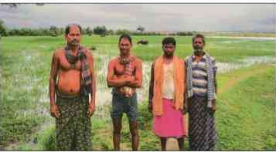
Farmers in Puri whose fields have been flooded with Chilika's brackish water

A report prepared by the Odisha government and international bodies such as the UN, the World Bank and the Asian Development Bank, which was released Tuesday, said the state needs Rs 29,315 crore for relief and rehabilitation efforts. It said housing, power, telecommuni-