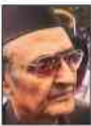
Backs bifurcation of state