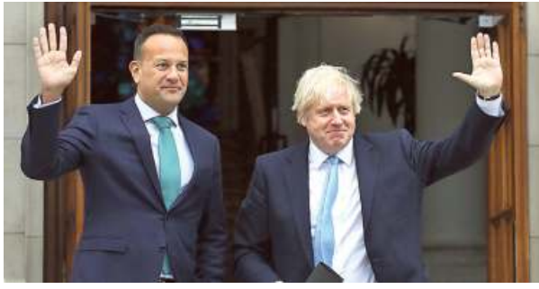
Tough talks: Irish Prime Minister Leo Varadkar, left, with his British counterpart Boris Johnson in Dublin on Monday.

A Bill demanding that Prime Minister Boris Johnson delay Britain's withdrawal from the European Union on October 31 if he cannot get a divorce deal became law on Monday but his office insisted that Brexit would happen by that date, "no ifs and buts".