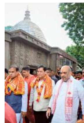
Amit Shah leaving the Kamakhya temple in Guwahati.

"The Citizenship Bill will not violate Article 371 that is applicable in the northeast. It will not affect any rights of the indigenous people, nor will it affect the Inner-Line Permit," he said. Any visitor to Arunachal Pradesh, Mizoram and Nagaland need to possess the permit for temporary stay. Manipur and Meghalaya have been de-