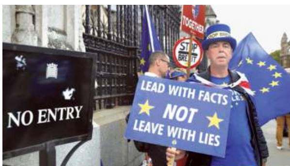
Opposing stance: An anti-Brexit campaigner outside the Houses of Parliament in London on Thursday.

Meanwhile in Brussels, EU chief Brexit negotiator Michel Barnier said there was "no reason to be optimistic" about striking a possible di-