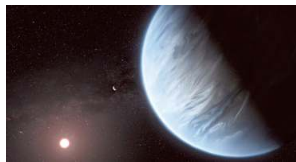
An artist's rendering shows exoplanet K2-18b, foreground, its host star and an accompanying planet in the system.

Of the more than 4,000 exoplanets detected to date, this is the first known to combine a rocky surface and