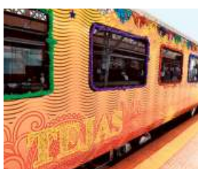
The Mumbai-Ahmedabad Tejas Express is likely to start operations this December.

To make the travel attractive, on offer are: free travel insurance worth ₹25 lakh, on-board infotainment services, doorstep baggage col-