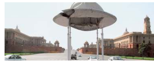
The government is aiming to have a brand-new Parliament building by the time India celebrates its 75th I-Day. FILE PHOTO

The ambitious project of the Narendra Modi government was set in motion with the publication of a request for proposal (RFP) by the Union Housing and Urban Affairs Ministry's Central Public Works Department on September 2. Design and architecture firms — both domestic and foreign — were invited to a pre-bid meeting on Thursday, ahead of the last date for submission of bids on Sep-