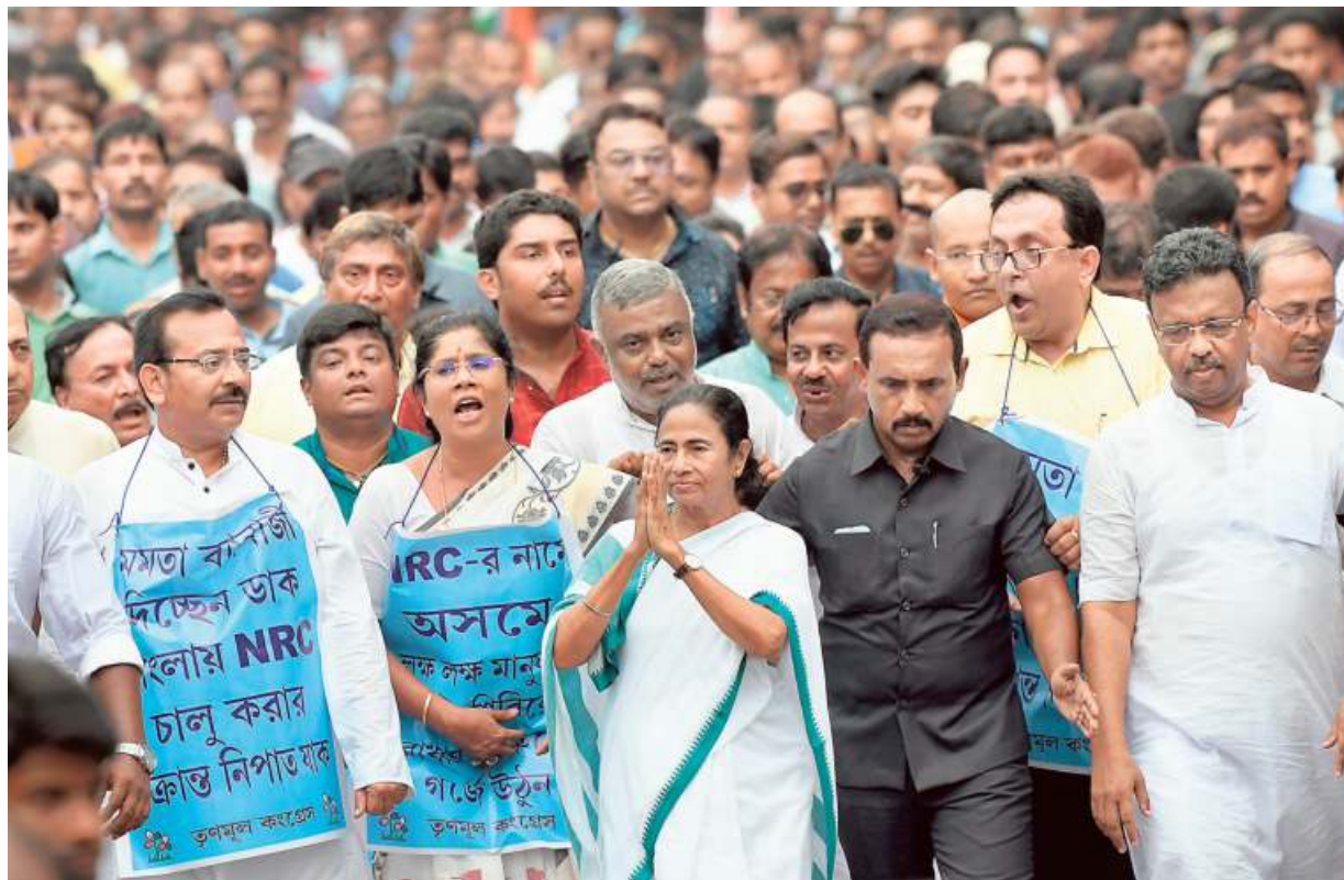
West Bengal Chief Minister and Trinamool Congress chief Mamata Banerjee during a padayatra against the National Register of Citizens in Assam, in Kolkata on Thursday. RAJEEV BHATT (REPORT ON PAGE 13)