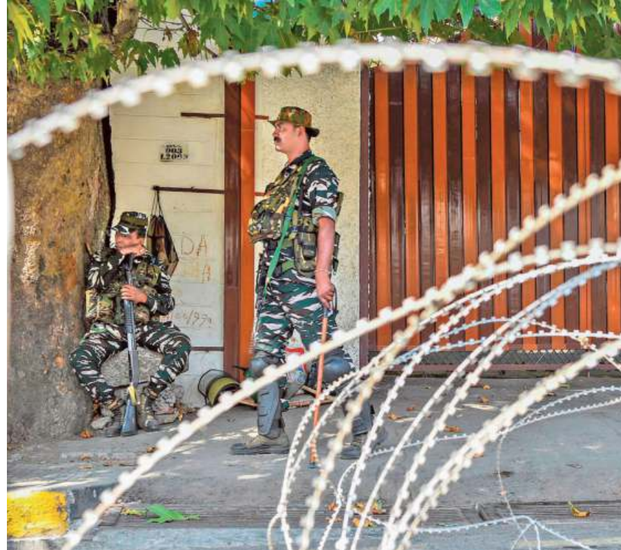
Under cover: Security men standing guard outside the house of NC leader Farooq Abdullah in Srinagar on Monday.