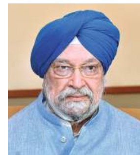
Hardeep Singh Puri

After the government's ambitious plan of redeveloping Parliament, the 3-km Central Vista that stretches from Rashtrapati Bhawan till India Gate and development of a common Central Secretariat was announced last week, some architects raised concerns about the project. The Cen-