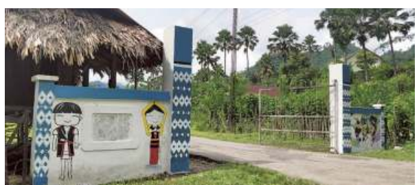
Model village: The entrance to Ledum.

"It was difficult at first to impose the fine. Some village