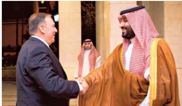
U.S. Secretary of State Mike Pompeo being greeted by Saudi Arabia's Crown Prince Mohammed bin Salman in Jeddah.

Mr. Pompeo's comments on Twitter came as he was in Jiddah, Saudi Arabia, after meeting with Crown Prince Mohammed bin Salman, the Kingdom's Defense Minister. The Saudis on Wednesday displayed missile and drone wreckage at a press conference, and cited other evidence they alleged shows the raid was "unquestionably sponsored by Iran".