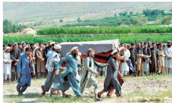
Villagers carrying the coffin of one of the victims after a drone strike in Khogyani district on Thursday.