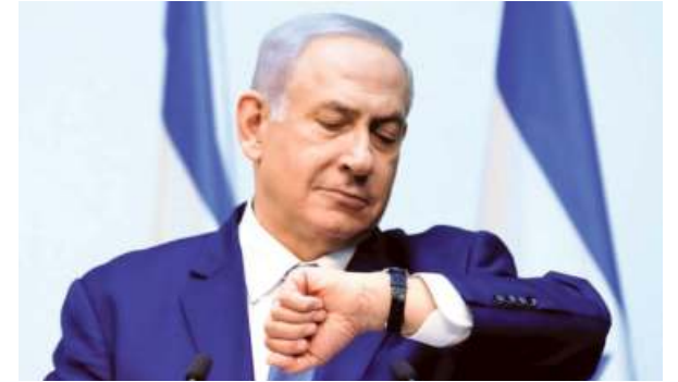
Political gridlock: Benjamin Netanyahu.

While both main parties are in a deadlock, Avigdor Lieberman, whose right-wing secular party Yisrael Beiteinu has won eight seats, has emerged as the king-maker. Mr. Lieberman, a former al-