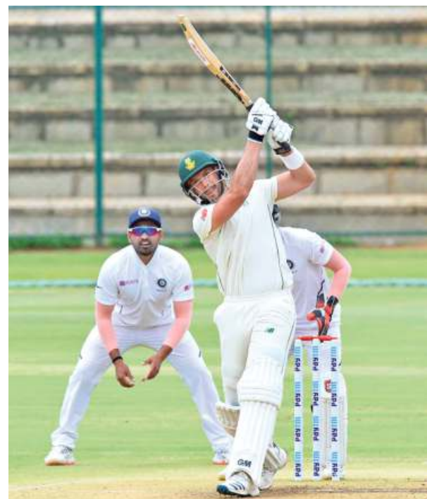
Going great guns! Aiden Markram made the Indians toil, hitting 20 fours and two sixes.

Mulder, touted as the heir to Jacques Kallis' all-rounder throne, was a picture of elegance. Much like Markram, he neatly moved his front