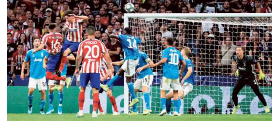
In the nick of time! Hector Herrera, second left, scores the 90th-minute equaliser.