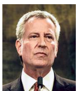
Bill de Blasio

"I feel like I've contributed all I can to this primary