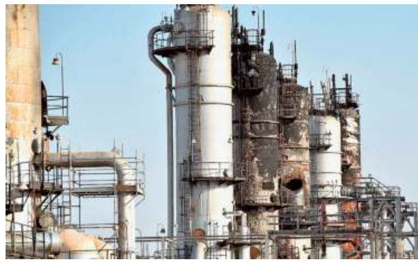
Aftermath of attacks: Damaged refining towers at Aramco's oil plant in Abqaiq, Saudi Arabia, on Friday.