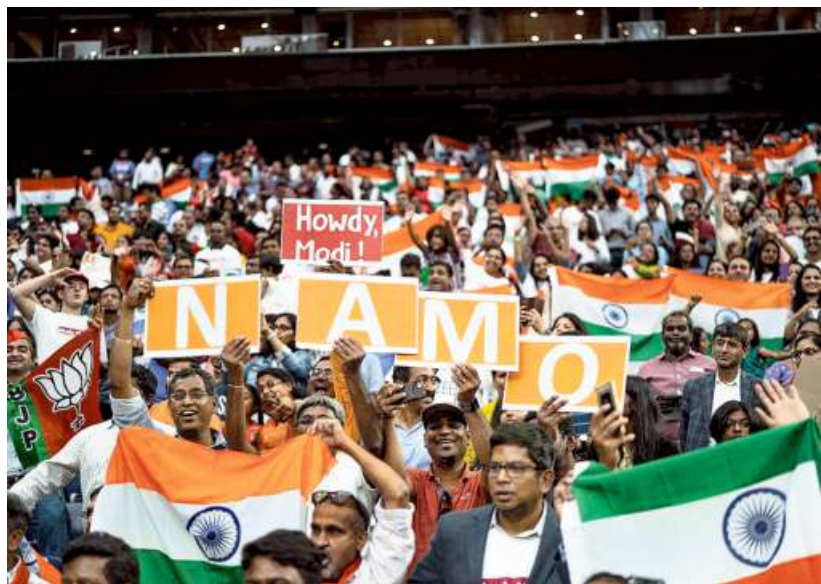
All that jazz: The 50,000-strong crowd at the NRG Stadium in Houston flashes the NaMo sign moments before the arrival of Prime Minister Narendra Modi and U.S. President Donald Trump, with folk artists pumping up the excitement levels.