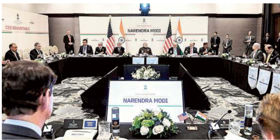
PM Narendra Modi at a meeting with CEOs from the energy sector in Houston.