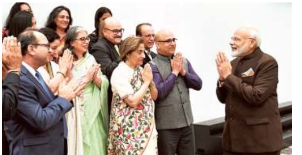
Making a promise: PM Narendra Modi exchanging greetings with a delegation of Kashmiri Pandits in Houston.