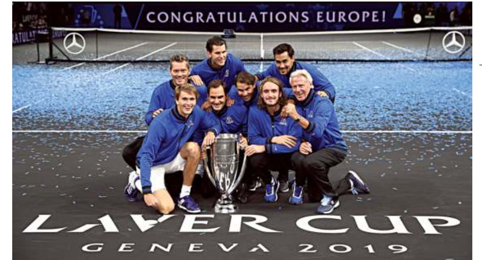
The winning cast: Team Europe completed a hat-trick of triumphs with a fantastic come-from-behind victory on Sunday.

Team World loses after being one win away from maiden win