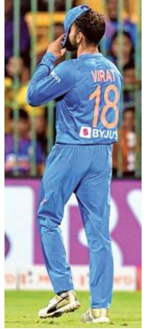
Virat Kohli.

"There was some miscommunication there. That is what I understood afterwards. The batting coach had a word with both of them, and there was a misunderstanding as to who had to go in at what stage. It was funny afterwards, as both wanted to walk in. It would have been funny had