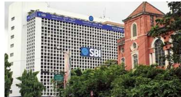
RBI had mandated external benchmark-linked interest rate for faster transmission of policy rates. •SOMASHEKAR G R N

"SBI had introduced floating rate home loans effective July 1, 2019. A few modifications have been made in the scheme effective October 1, 2019 to comply with the lat-