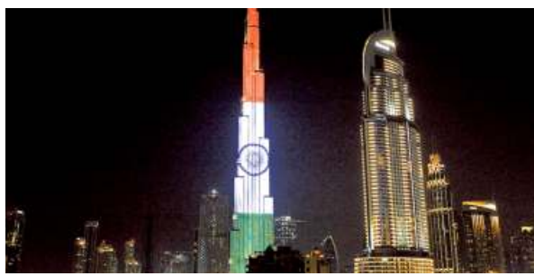
Mutual understanding: Both sides also discussed the implementation of bilateral agreements.

The joint statement comes following the seventh meeting of the UAE-India High Level Joint Task Force on Investments, which was co-chaired by Sheikh Hamed bin Zayed Al Nahyan, Managing Director of Abu Dhabi Investment Authority (ADIA), and Indian Minister