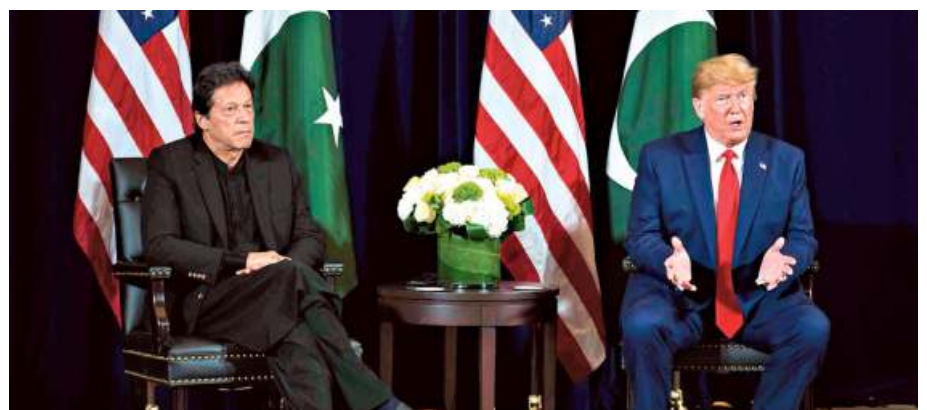
U.S. President Donald Trump with Pakistan Prime Minister Imran Khan in New York.

"I also have a very good relationship with India. I