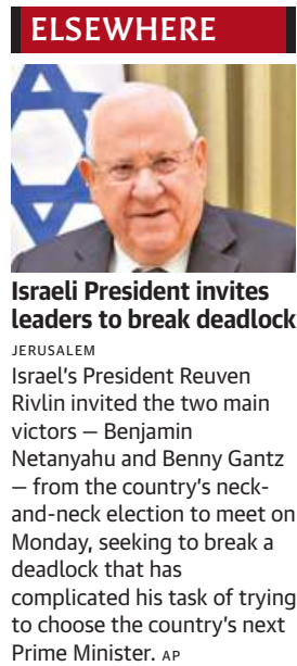
Israeli President invites leaders to break deadlock JERUSALEM

Israel's President Reuven Rivlin invited the two main victors — Benjamin Netanyahu and Benny Gantz — from the country's neck-and-neck election to meet on Monday, seeking to break a deadlock that has complicated his task of trying to choose the country's next Prime Minister. AP