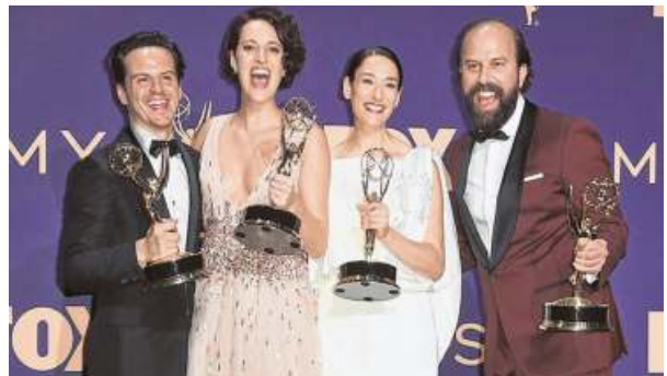
Glittering gala: (Left to right) Andrew Scott, Phoebe Waller-Bridge, Sian Clifford and Brett Gelman in Los Angeles.

Ms. Waller-Bridge won three Emmys on the night, including for best actress in a