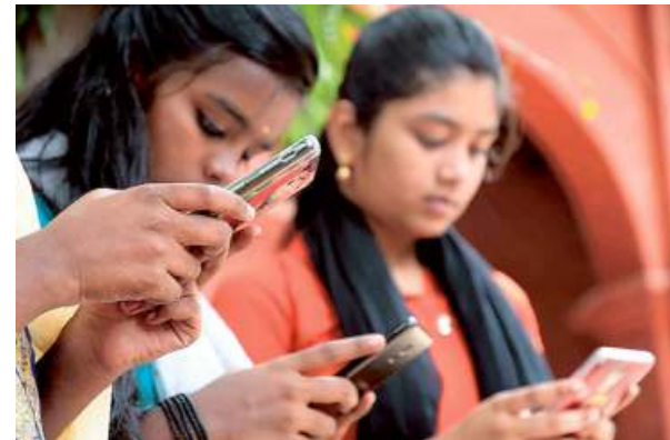
India calling: The country has set a target of making 100 crore mobile handsets indigenously by 2025. *S. SIVA SARAVANAN

"The mobile handset manufacturing industry is continuing its juggernaut. 800% year-on-year growth in exports has been witnessed during 2018-19 over 2017-18 figures though on a small base. This is a humble but robust beginning for a glorious future which bodes well for the nation," ICEA chairman Pankaj Mohindroo wrote in