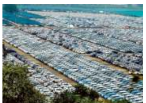
Big drive: The discounts range from ₹50,000 to ₹1,50,000 depending on the car brand.

car maker, has cut prices of several models by ₹5,000 to pass on the benefit of reduction in corporate tax by the government. This is apart from the discounts being offered by the company and its