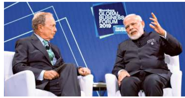
Former New York Mayor Michael Bloomberg and PM Narendra Modi speaking at the Bloomberg Global Business Forum.

"One challenge that is before us today is that of nuclear energy, because, since we are not a member of the NSG, we do not really have the ability to get the fuel for