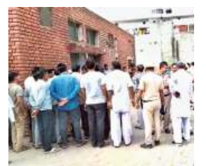
Relatives of the deceased waiting outside the mortuary in Jind.

The men, aged between 18 and 21, had gone to Hisar for medical examination as part of the recruitment drive. On their way back, they had boarded an autorickshaw. The oil tanker hit the vehicle on Hansi Road,