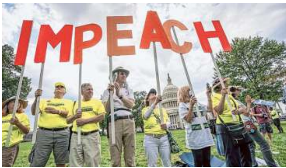
Activists rallying for the impeachment of President Donald Trump at the Capitol in Washington on Thursday.

She announced that House Intelligence Commit-