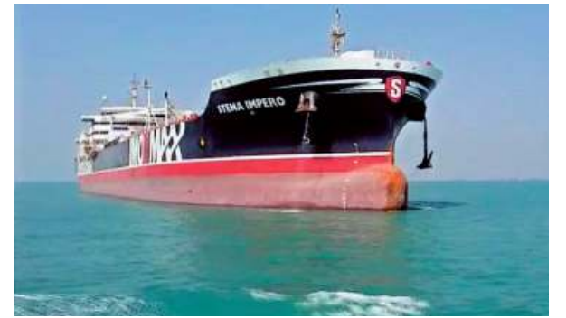
Stena Impero sets sail in Gulf as it heads towards the international waters on Friday.

crew have "given a written, official statement that they have no claims", it added.