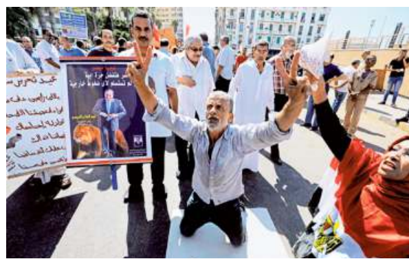
Supporters of Egypt President Abdel Fattah al-Sisi demonstrating in Alexandria on Friday.

Mr. Sisi, who was in New York this week attending the UN General Assembly, returned to Cairo on Friday morning, where he was greeted off his plane by senior Ministers and later stopped to speak to a crowd of supporters on the roadside.