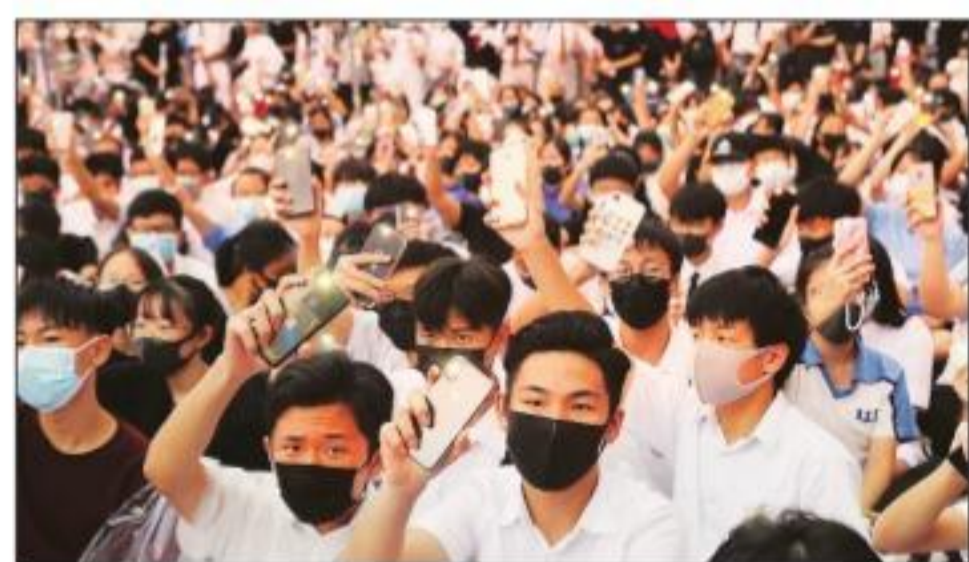
School students at a protest in Hong Kong on Monday.

Lam's dramatic and at times anguished remarks offer the clearest view yet into the thinking of the Chinese leadership as it navigates the unrest in Hong Kong, the biggest political crisis to grip the country since the Tiananmen Square protests of 1989.