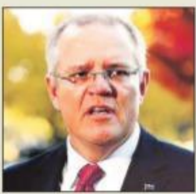
SCOTT MORRISON Australian PM