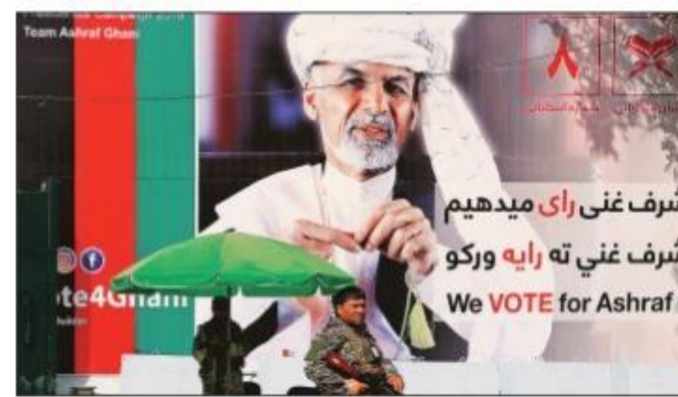
Afghan security personnel near a poster of Afghan President Ashraf Ghani in Kabul Tuesday.

The Sun newspaper said Johnson was planning a snap election in five weeks' time — before Brexit — if lawmakers defeat him. REUTERS