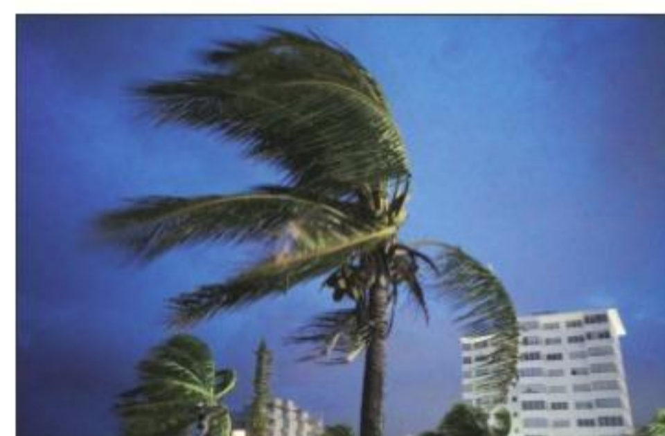
In Freeport, Bahamas on Sunday. AP

Information began emerging from the affected islands, with Bahamas Power and Light saying there is a total blackout in New Providence, the archipelago's most populous island, Abaco. "The reports out of Abaco as everyone knows," company spokesman Quincy Parker told ZNS Bahamas radio station, "were not good." AP