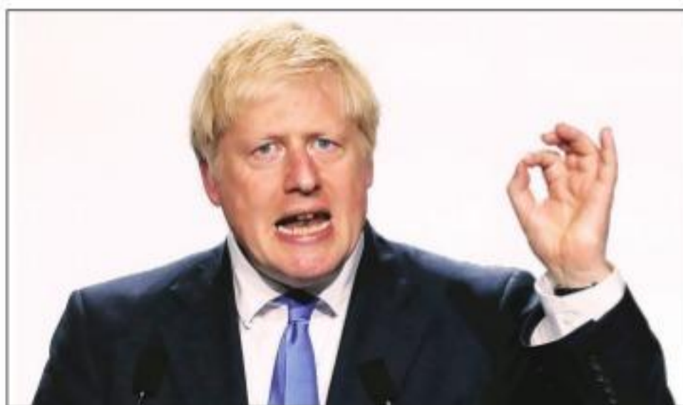
Johnson's promise to take the country out of the European Union on October 31 with or without a divorce deal has propelled the United Kingdom towards a constitutional crisis

Just 24 hours until Parliament returns on Tuesday from its summer break, Johnson's enforcers warned rebels that if they voted against the government they would be kicked out of his Conservative Party.