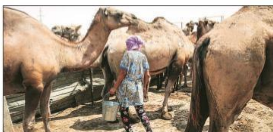
At a camel farm in Aktau, in western Kazakhstan.

its post-Soviet economic slump, the camel herds also recovered. The number of camels in