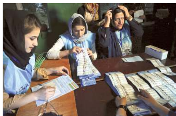
The countdown begins: Election workers counting ballots at a polling station in Kabul on Saturday.

Initial estimates and observations at polling stations suggest a light turnout among 9.6 million eligible voters.