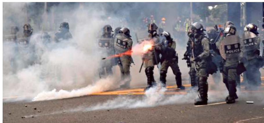
Escalating violence: Police using tear gas to disperse protesters in Hong Kong on Sunday.

from the tear gas behind umbrellas and held their ground on Sunday, some throwing tear gas canisters back at police as a helicopter flew overhead.