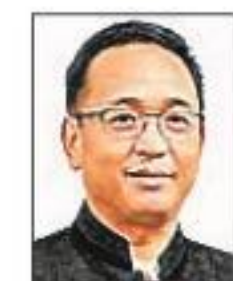
Was found guilty in corruption case

SIKKIM CHIEF Minister Prem Singh Tamang, in all likelihood, will retain his post as the Election Commission (EC) ruled in his favour on Sunday, reducing the period of his disqualification by almost five years. As first reported by The Indian