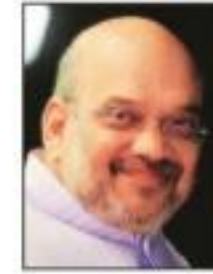
'41,800 people died in militancy, none raised human rights of jawans'

TARGETING THE Opposition for raising human rights concerns in the wake of the Centre's move to scrap Article 370 and launch an unprecedented communications clampdown in Jammu and Kashmir, Union Home Minister Amit Shah said Sunday that 41,800 people have died in the