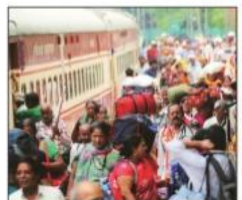
Rlys staring at shortfall of Rs 30,000 cr by year-end. File

The August-end figures indicate that Railways has already overshot its spending. Its