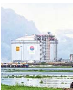
Tellurian is looking at different investors for the project. ■ THULASI KAKKAT

For the current project, Tellurian is looking at a number of investors including Petronet India to help finance construction for Driftwood, offering 1 million tonnes per year of offtake for every $500 mn of investment.