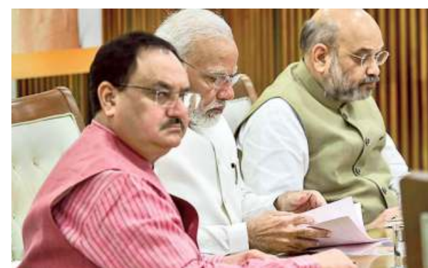
Prime Minister Narendra Modi flanked by Home Minister Amit Shah and BJP working president J.P. Nadda in New Delhi.

For Dharamshala and Pachhad in Himachal Pra-