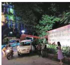
Police personnel at IIT-M ahead of Prime Minister's visit.

"We can assure that there will be no traffic congestion around IIT-Madras or on GST Road as he is travelling by a chopper. Besides, all the VIPs have been asked to arrive by 8 a.m. and entry will be restricted after 8.30 a.m. So before the peak