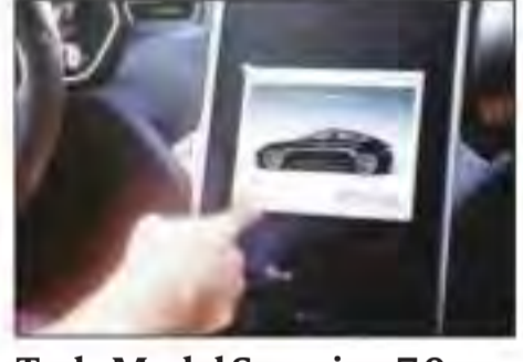
Tesla Model S version 7.0 update containing Autopilot features.

The 2014 Model S Autopilot system was engaged continuously for the final 13 minutes 48 seconds of the trip before the vehicle struck a fire truck parked on