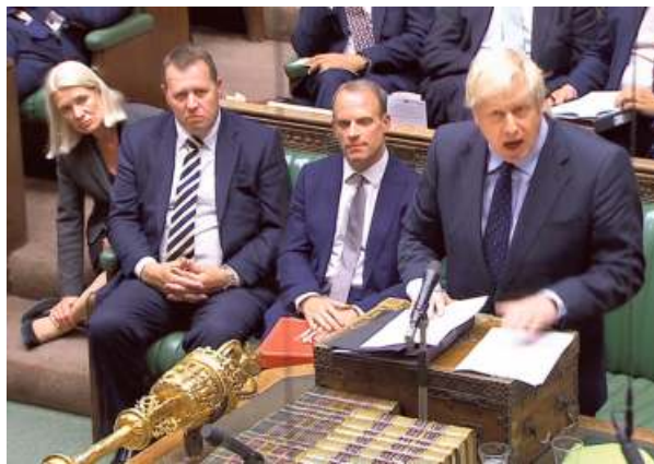
In limbo: British Prime Minister Boris Johnson speaking in the Parliament in London on Tuesday.

As a result, the Prime Minister no longer has a major-