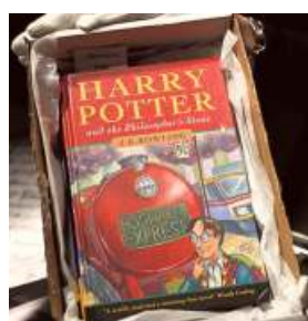
A copy of Harry Potter and the Philosopher's Stone by J.K. Rowling.

The series of books spins an epic tale of good and evil focused on the adventures of a young wizard as he struggles against the dark wizard Lord Voldemort.