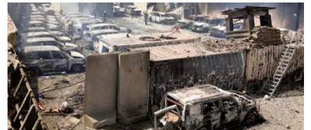
Terror-hit: Afghan firefighters at work after a suicide attack at a parking lot in Kabul on Tuesday.

Taliban spokesman Zabihullah Mujahid told that "we understand that peace talks are going on... but they must also understand that we are not weak and if we enter into talks... we enter from a