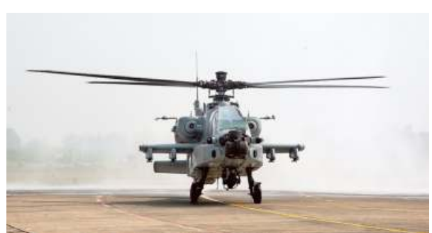
Cutting edge: The latest generation of the Apache will be part of the 125 Helicopter Unit at Pathankot.

The Indian Air Force (IAF) on Tuesday inducted eight AH-64E Apache attack helicopters into service at the Pathankot Air Force Station. The U.S.-made Apache is the most advanced multi-role heavy attack helicopter in the world.