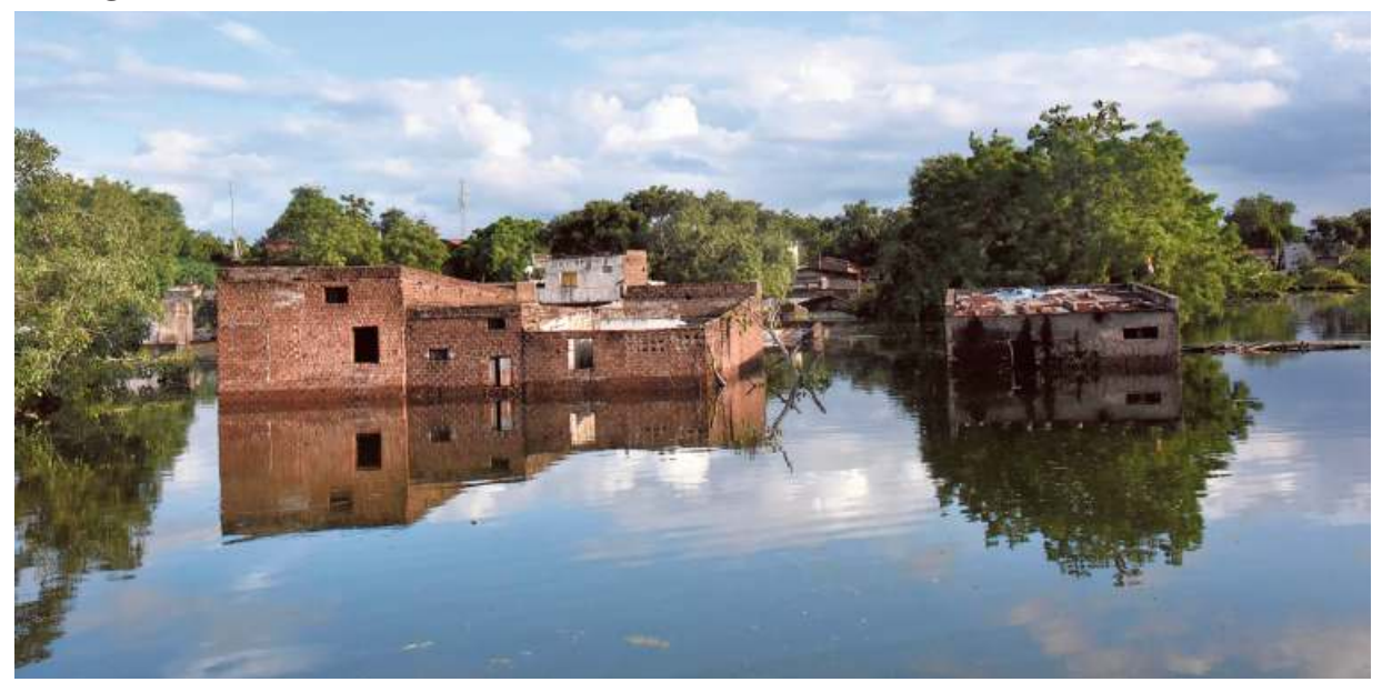
Consigned to history: As the Sardar Sarovar Dam is being filled to its full level of 138.68 metres by October 15, Nisarpur in Dhar district of Madhya Pradesh has been submerged by the backwaters. Residents have been shifted to a settlement.