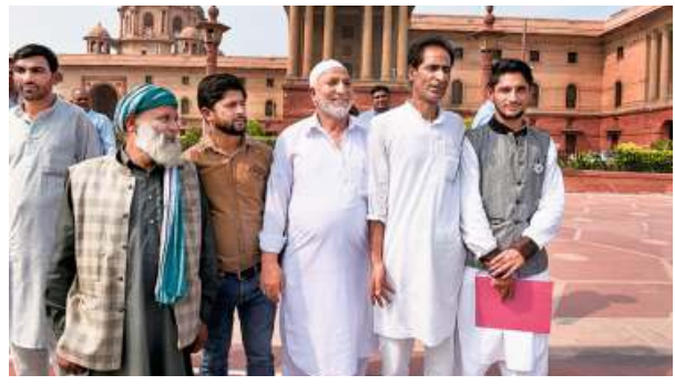
Fruitful meeting: A group of sarpanches emerging from a meeting with Amit Shah in New Delhi on Tuesday.

The village heads, who were elected last year, demanded security, with some of them from south Kashmir still living in hotels in Srinagar under police protection as they have not been able to go back to their villages.