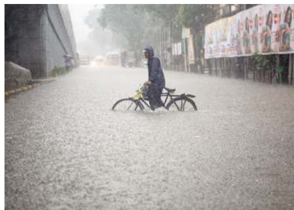
Monsoon fury: The flooded Andheri subway, top, and a flooded street in Parel.

Due to the heavy showers, there were multiple point failures at Virar, affecting suburban rail services on Western Railway (WR).