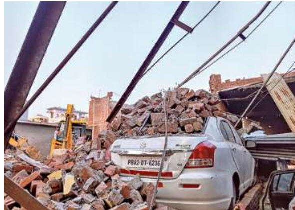
A car is seen buried under the debris after the blast in the firecracker factory on Wednesday.

An explosion took place around 4 p.m. in the factory, situated in a three-storey building in the residential area. The impact of the blast was so powerful that a few nearby buildings and parked vehicles were damaged. Teams of the National Disaster Response Force (NDRF) and the State Disaster Response Force (SDRF) have been deployed. Police sources said the death toll in the incident might rise as some people were trapped under the debris of the building that collapsed after the explosion.