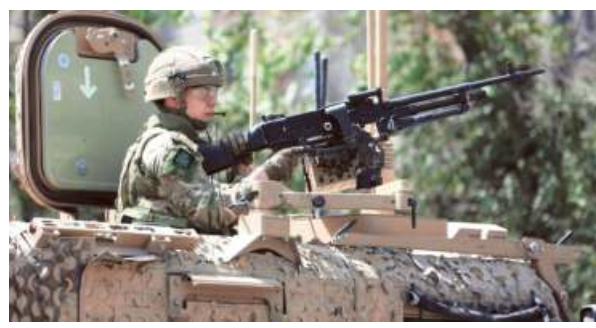
Surge in violence: Resolute Support (RS) forces at the site of a car bomb explosion in Kabul on Thursday.

The Taliban claimed responsibility for the attack even as the insurgents and U.S. officials have been negotiating a deal on a U.S. troop withdrawal in exchange for Taliban security guarantees. "At least 10 civilians have been killed and 42 injured