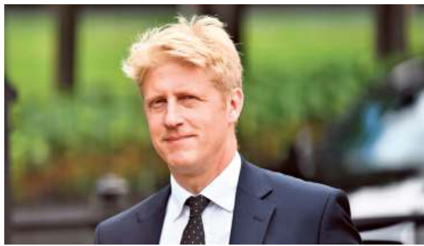
A file photo of Jo Johnson, Conservative MP and brother of PM Johnson, who quit the government on Thursday.

In a personal blow, the Prime Minister's brother, Jo Johnson, quit the government, saying he could no longer endure the conflict "between family loyalty and