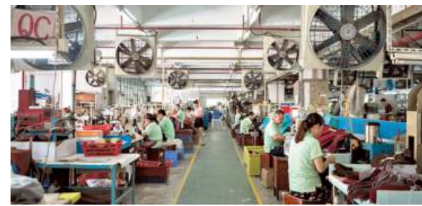
Next stop: Workers making cowboy boots for export to the U.S. at a factory in Dongguan, China.

If held as scheduled, the talks would take place after new U.S. tariffs kick in,