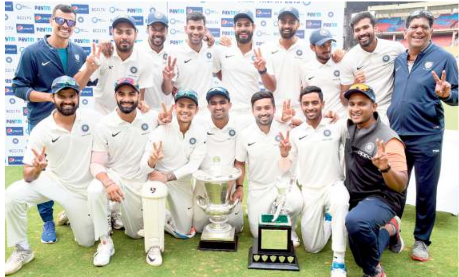
Mission accomplished: The India Red players with the Duleep Trophy.