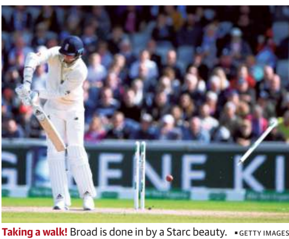
Taking a walk! Broad is done in by a Starc beauty.

Earlier, England, which had resumed at 200 for five, avoided following-on, thanks to Jos Buttler's cover-driven four off Mitchell Starc. Buttler was last man out, bowled for 41.