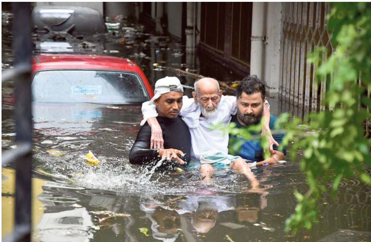
Going under: Rescuers evacuating an elderly man at Rajendra Nagar in Patna on Monday. Parts of Bihar and Uttar Pradesh are reeling due to floods after heavy rain in the past few days, with the death toll mounting to 136. *RANJEET KUMAR (PAGE 9)