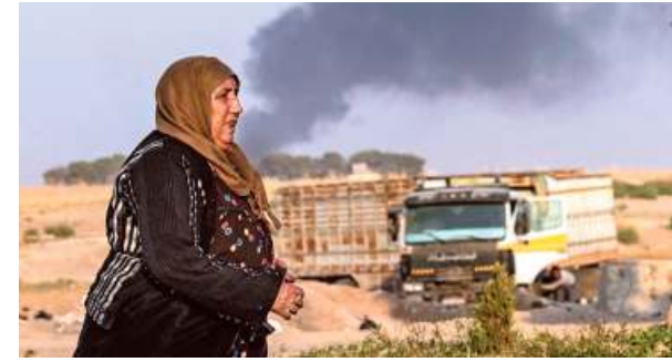
Military push: A woman passes by as smoke billows following bombardment by Turkish forces in Syria.

Turkey launched airstrikes and fired artillery aimed at crushing Kurdish fighters in northern Syria on Wednesday, a day after U.S. troops pulled back from the area, paving the way for an assault on forces that have long been allied with the U.S. President Recep Tayyip Erdogan announced the launch of the attack on Twitter, labelling it "Operation Peace Spring". "Our mission is to prevent the creation of a terror corridor across our southern border, and to bring peace to the area," Mr. Erdogan said in a tweet. Minutes before his announcement, Turkish jets began pounding suspected positions of Syrian Kurdish forces in the town of Ras al Ayn, according to Turkish media and Syrian activists. Mr. Trump's move, which has drawn harsh bipartisan opposition at home, represented a shift in U.S. policy