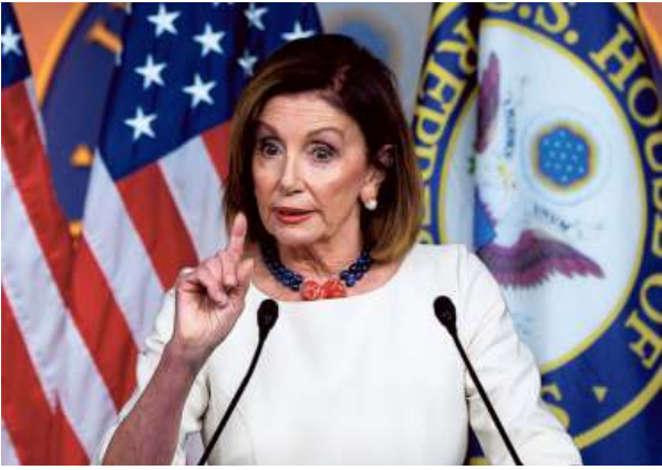
Bumpy procedure: U.S. House Speaker Nancy Pelosi.

actions in office - is a naked political strategy that began the day he was inaugurated, and perhaps even before," Mr. Cipollone wrote, accusing the Democrats of seeking to overturn Mr. Trump's 2016 electoral victory and influence the elections in 2020. The letter, which echoed some of Mr Trump's views on the impeachment process, said that for the inquiry to be legal, the full House should have voted on it - a position counter to Ms. Pelosi assertion that such a vote was not constitutionally required. 'Normalise lawlessness' "Consistent with the duties of the President of the U.S., and in particular his obligation to preserve the rights of future occupants of his office, President Trump cannot permit his Administration to participate in this partisan inquiry under these circumstances," Mr. Capillone wrote. Ms. Pelosi responded to Tuesday's letter by calling it "manifestly wrong" in a statement and warned that