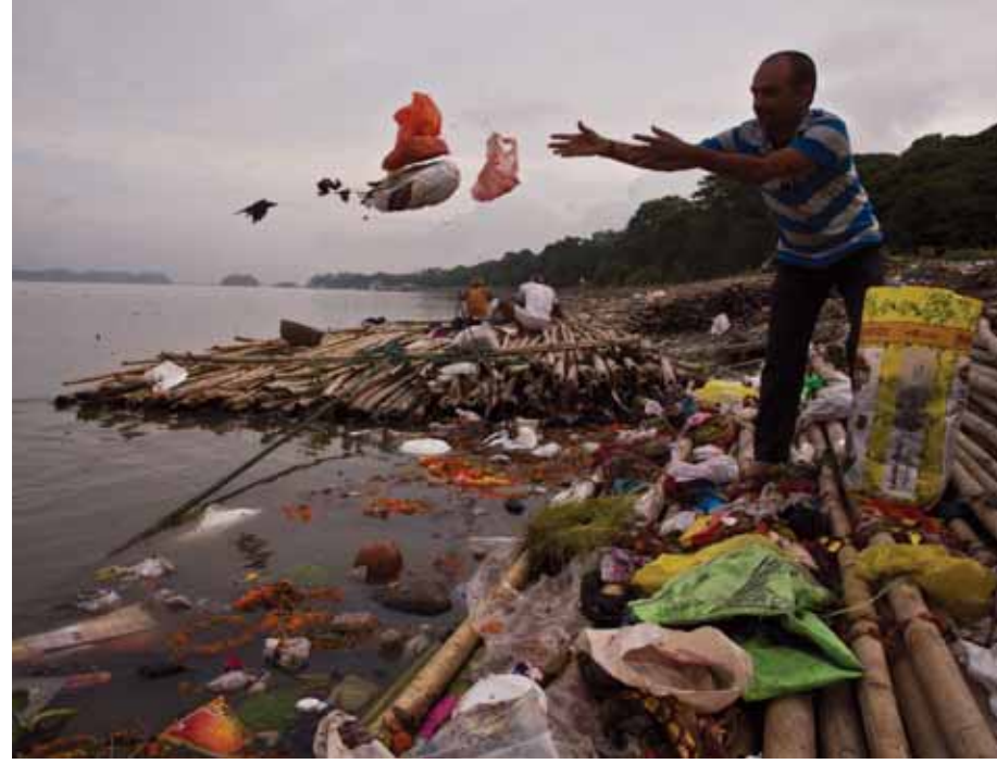
A devotee throws flowers and plastic bags into River Brahmaputra in Guwahati on Wednesday

A 55-year-old man was injured after he allegedly jumped on to the Metro tracks and was hit by a moving train at Uttam Nagar East station on the Delhi Metro's Blue Line. The incident occurred on Wednesday afternoon and it led to brief delay in Metro services on the corridor.