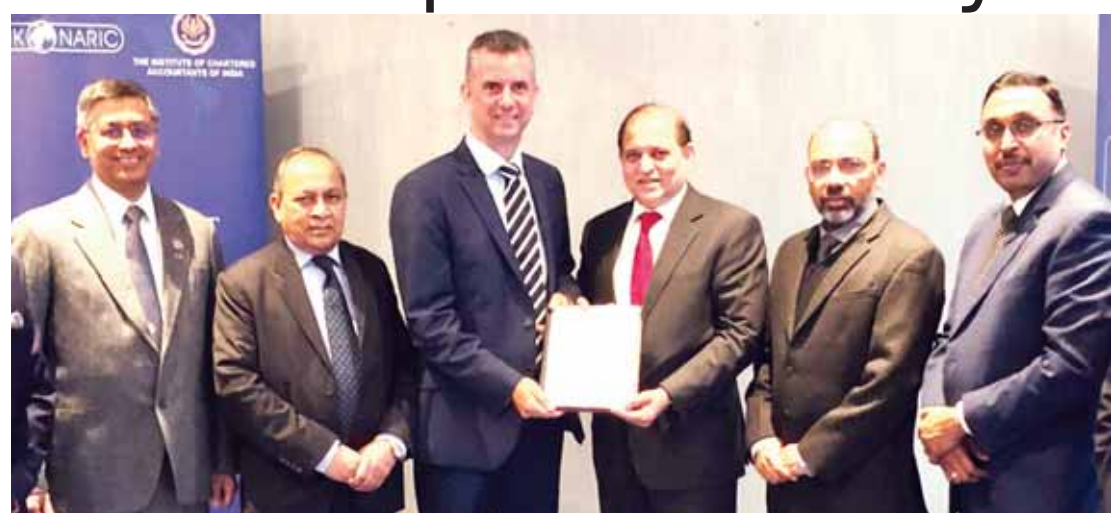
Speaking on the UK NARIC

The Institute of Chartered Accountants of India (ICAI) has always strived for academic and professional excellence for its key stakeholders — students and members. With the aim of expanding the opportunities for professionals in foreign jurisdictions, the Institute had engaged UK NARIC (The National Recognition Information Centre for the United Kingdom), a renowned UK national agency responsible for providing information and expert opinion on qualifications and skills worldwide to conduct an independent benchmarking study, evaluating the comparability of the ICAI Intermediate and Final level in the context of the UK and UAE education systems.