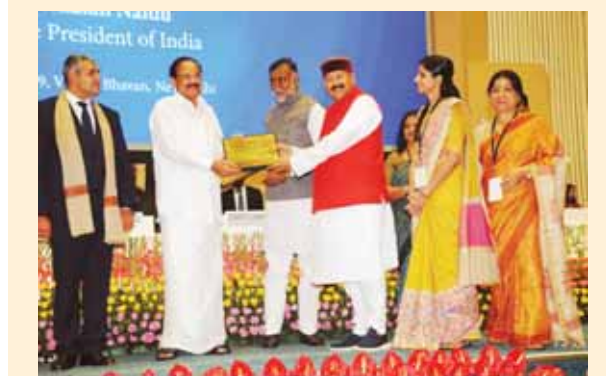
Uttarakhand is an idol film tourism destination in India as it replete with natural charm and has numerous unexplored destinations. Recently, Uttarakhand has also bagged the honour of being the best film promotion friendly state in the country. Uttarakhand film policy has eased film shooting by facilitating clearances through Single Window System — exemption on shooting fees on films made in the state, provision of subsidies of upto ₹25 lakh for regional films, upto ₹1.5 crores for Bollywood films and 50 per cent discount on GMVN and KMVN guest houses during the shooting period.