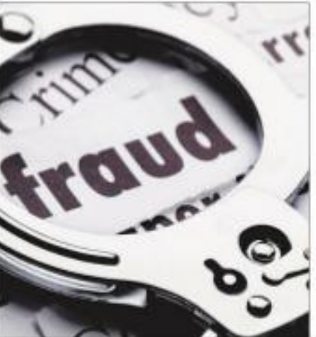
Submitted fake papers

Based on these forged documents, the company "induced the bank" to avail credit facilities to the