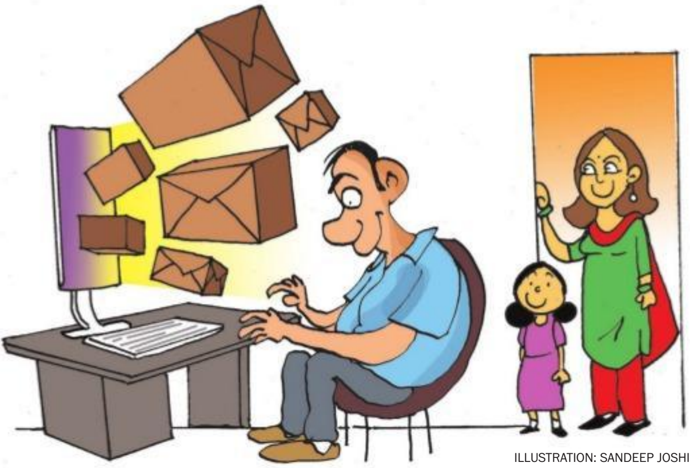
ILLUSTRATION: SANDEEP JOSHI