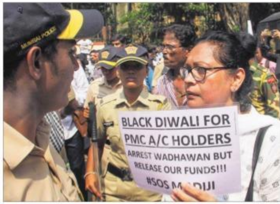
PMC Bank depositors protest outside a court in Mumbai. PTI

According to sources in the economic offences wing of the Mumbai police, properties, cash and other assets, includ-