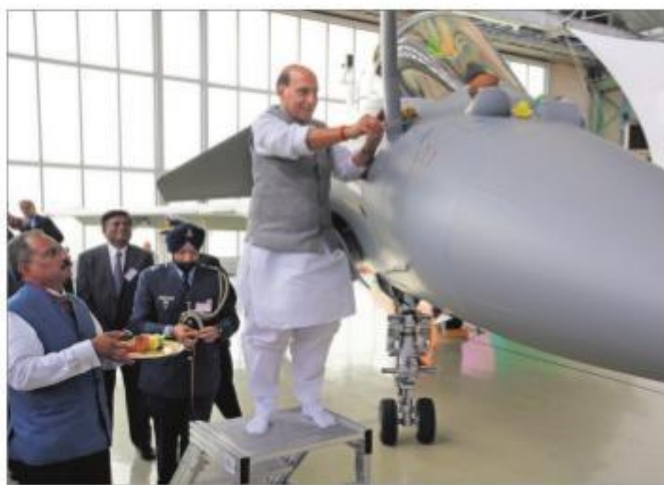
Defence Minister Rajnath Singh performed 'shastra puja' after receiving the first Rafale jet in France on Tuesday.

Not just Kharge, several Congress leaders have registered objection to the "shastra puja", which defence officials