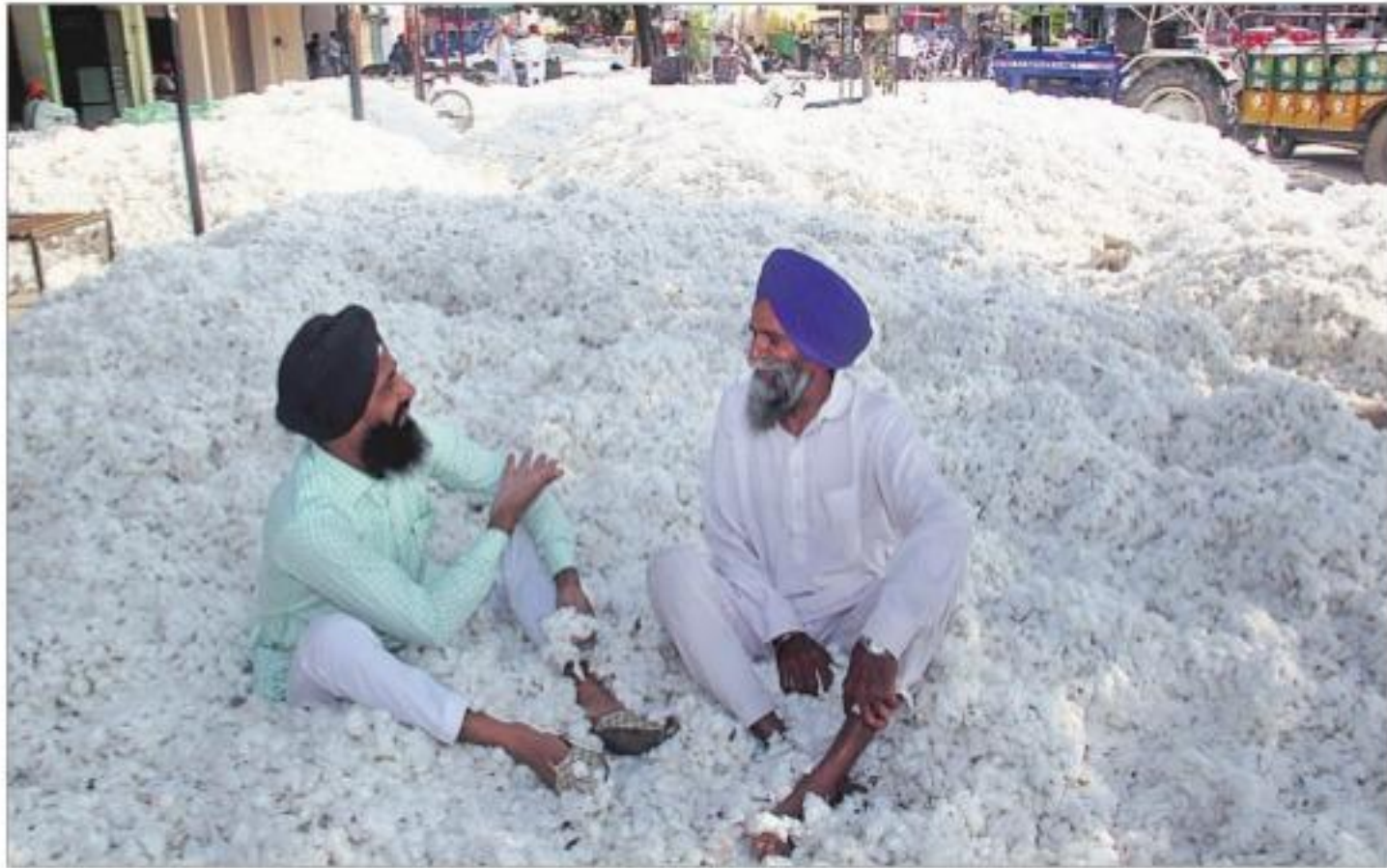
Farmers wait for buyers at the grain market in Bathinda on Wednesday.