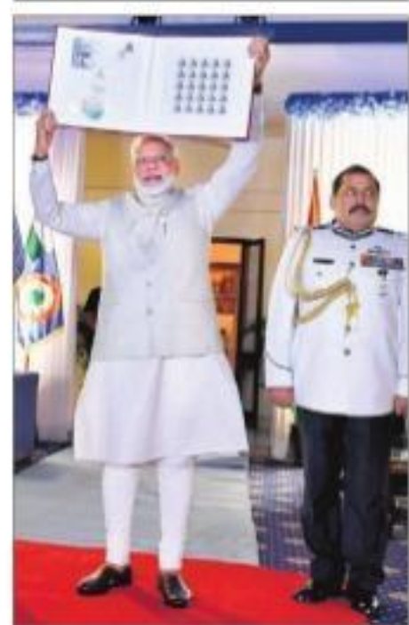
PM Narendra Modi releases a stamp on the birth centenary of Late Marshal of IAF Arjan Singh in New Delhi on Wednesday.