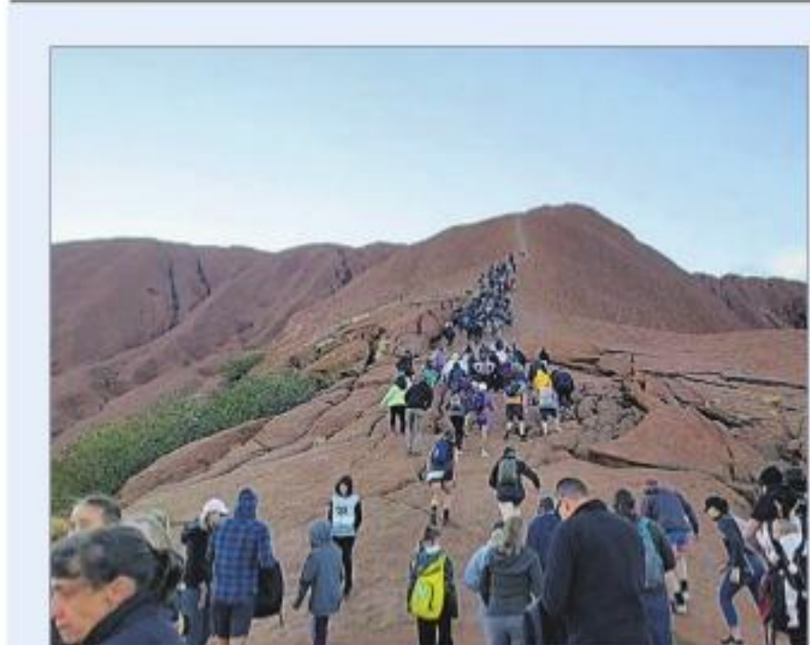
FINAL PUSH: Tourists climb Uluru, a large sandstone rock formation at Uluru-Kata Tjuta National Park, Northern Territory, in Australia, ahead of a ban on climbing. REUTERS

Thousands rush to climb Australia's Uluru ahead of ban SYDNEY: Thousands of people are rushing to climb Australia's Uluru, ignoring the calls of indigenous people to stay off what they consider a sacred monolith, before the ascent is permanently banned at the end of the month. Visitors will no longer be able to scale the Australian landmark, formerly known as Ayers Rock from October 26, following a decades-long campaign by indigenous communities to protect it. The UNESCO World Heritage-listed 348-metre rock, famed for its deep red-ochre hues, is a top tourist draw near Alice Springs. REUTERS