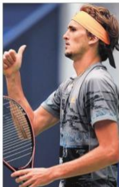
Alexander Zverev overcame Jeremy Chardy 7-6(13) 7-6(3) on Wednesday.

"I think when you feel pressure you're doing well. It's something that is inevitable so you might as well embrace it and accept it." — Novak Djokovic