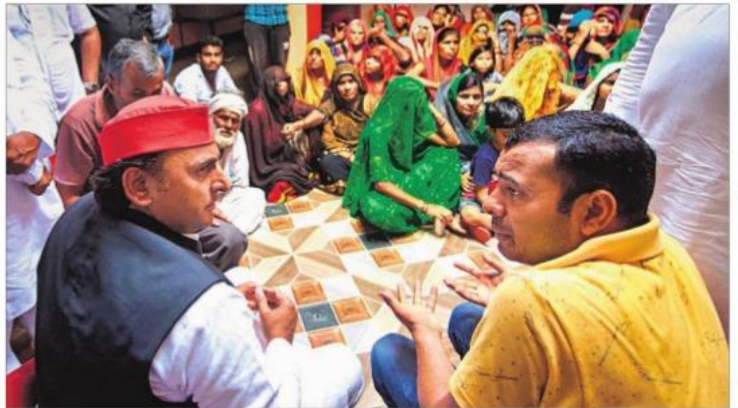
SP chief Akhilesh Yadav meets family members of Pushpendra Yadav in Jhansi on Wednesday.

"For a party used to worshipping Quattrocchi, 'shastra puja' is naturally a problem," the BJP mocked the Congress. Italian businessman Ottavio Quattrocchi was named by the CBI as the conduit for the Bofors bribe.