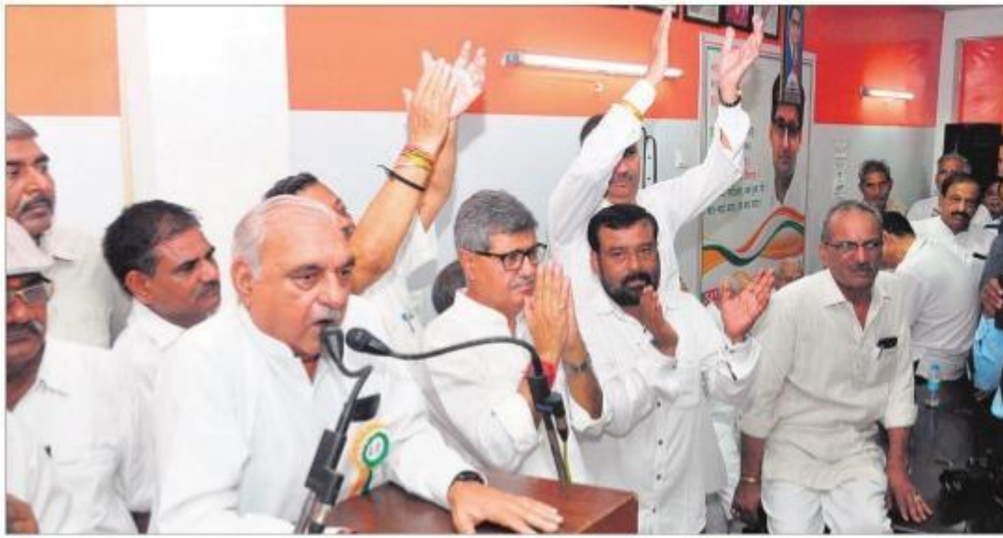
Former Chief Minister Bhupinder Singh Hooda at a public meeting in Rohtak.

"Even the Prakash Singh Committee constituted by the state government had held the top government functionaries responsible for the riots. However, instead of taking any action against the culprits, the government junked the committee's report," Hooda stated.