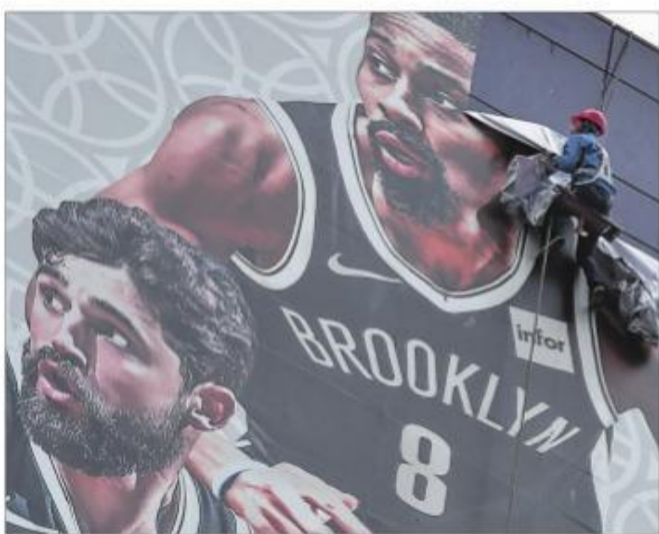
A worker removes a promotional banner for the pre-season game between the Brooklyn Nets and the LA Lakers in Shanghai.

A Wednesday afternoon press conference with