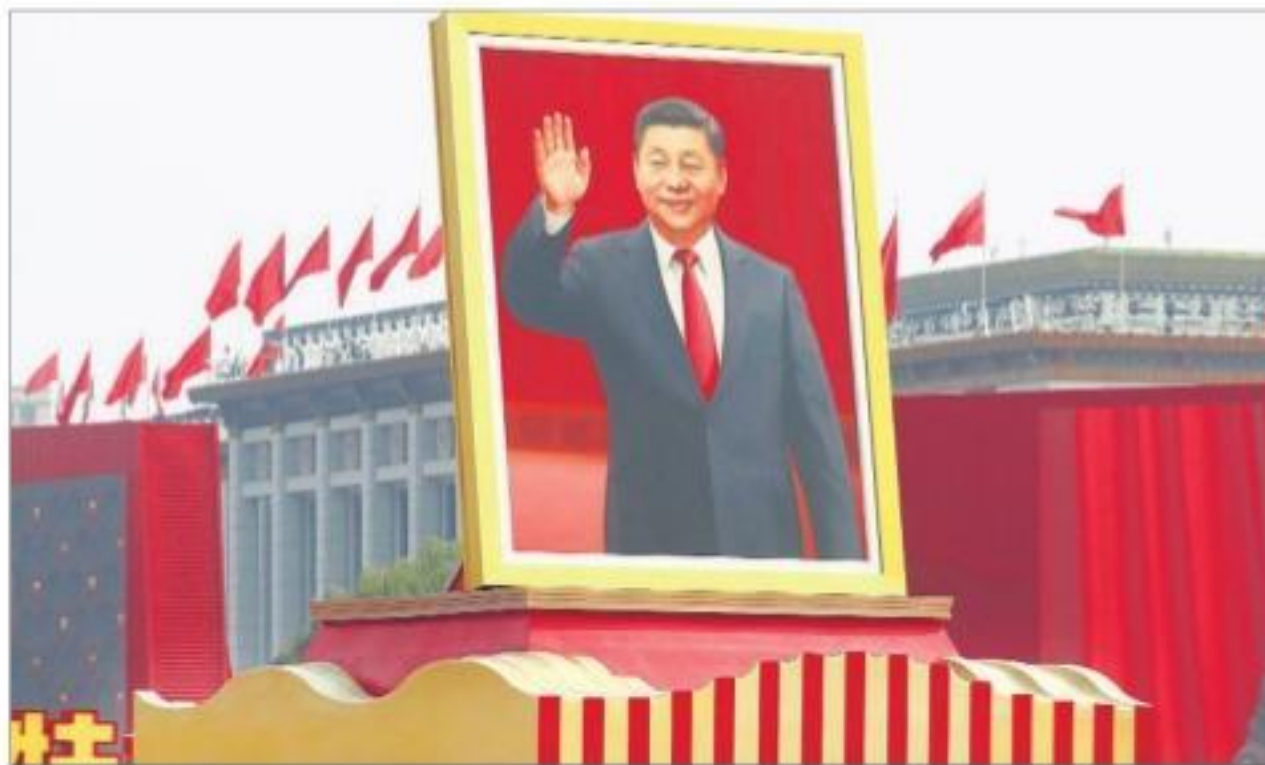
BUSINESS GOAL: China is desperate to have India on board the Regional Comprehensive Economic Partnership (RCEP), a mega trade agreement.

A media report of September 28 is alarming: 'India may cut duties on 80 per cent of Chinese imports under the Regional Comprehensive Economic Partnership (RCEP).' Let's understand that imported Chinese goods have already created havoc in the Indian system, with virtually 100 per cent 'undervaluation' of goods through congenial 'mis-declaration' for almost two decades, thereby resulting in a huge loss of revenue to the Indian exchequer. A mindboggling modus operandi is ensuring gross failure of the Indian system. With special reference to valuation by misdeclaration certificates of dubious origin on/of imported Chinese