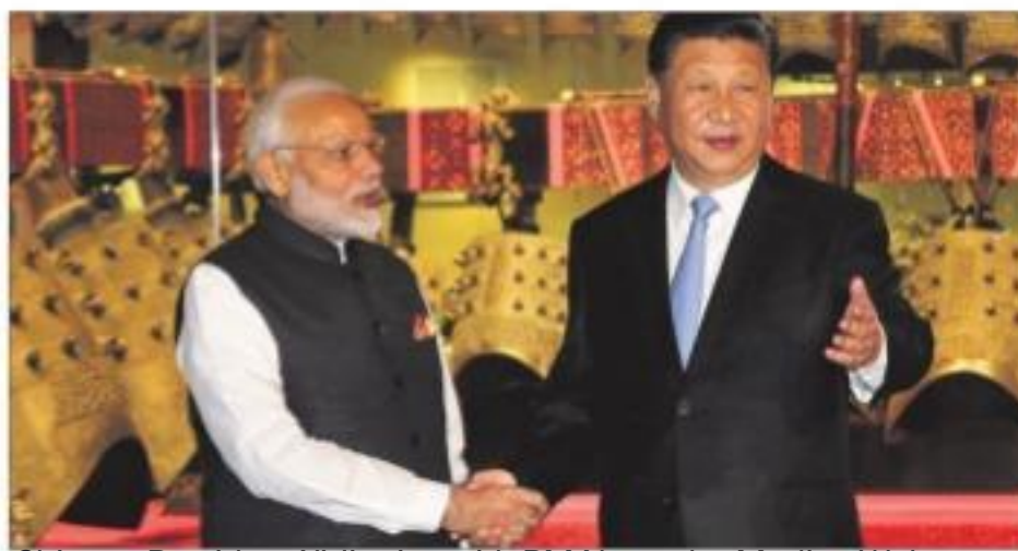
Chinese President Xi Jinping with PM Narendra Modi at Wuhan.

Despite deceleration, 40 emerging market are forecast to have real GDP growth rates above 5 per cent, the IMF chief said.