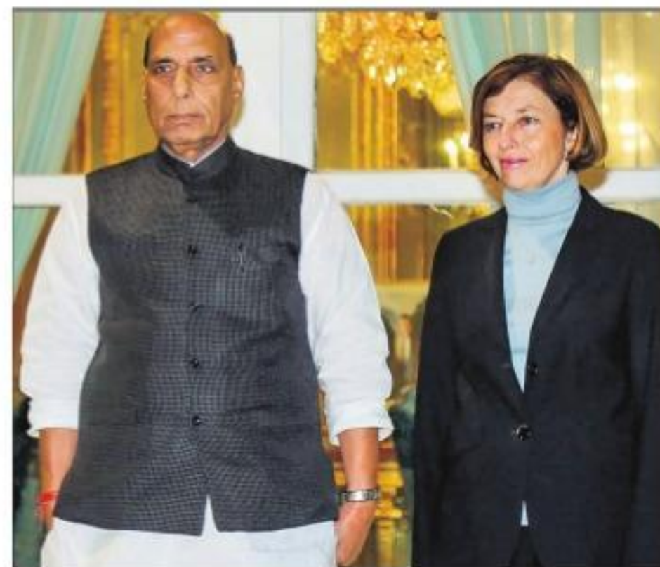
Defence Minister Rajnath Singh with his French counterpart Florence Parly during the annual defence dialogue in Paris.

During the dialogue held in Paris, the two ministers comprehensively reviewed the entire gamut of bilateral defence cooperation, which is a key pillar of India-France strategic partnership. They also exchanged views on contemporary regional and inter-