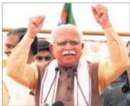
Khattar at Berli in Rewari.

KOSLI (REWARD), OCTOBER 9 Chief Minister Manohar Lal Khattar today reiterated his government's promise to establish AIIMS in Rewari district. He made this announcement while addressing a rally at Berli village in the district.