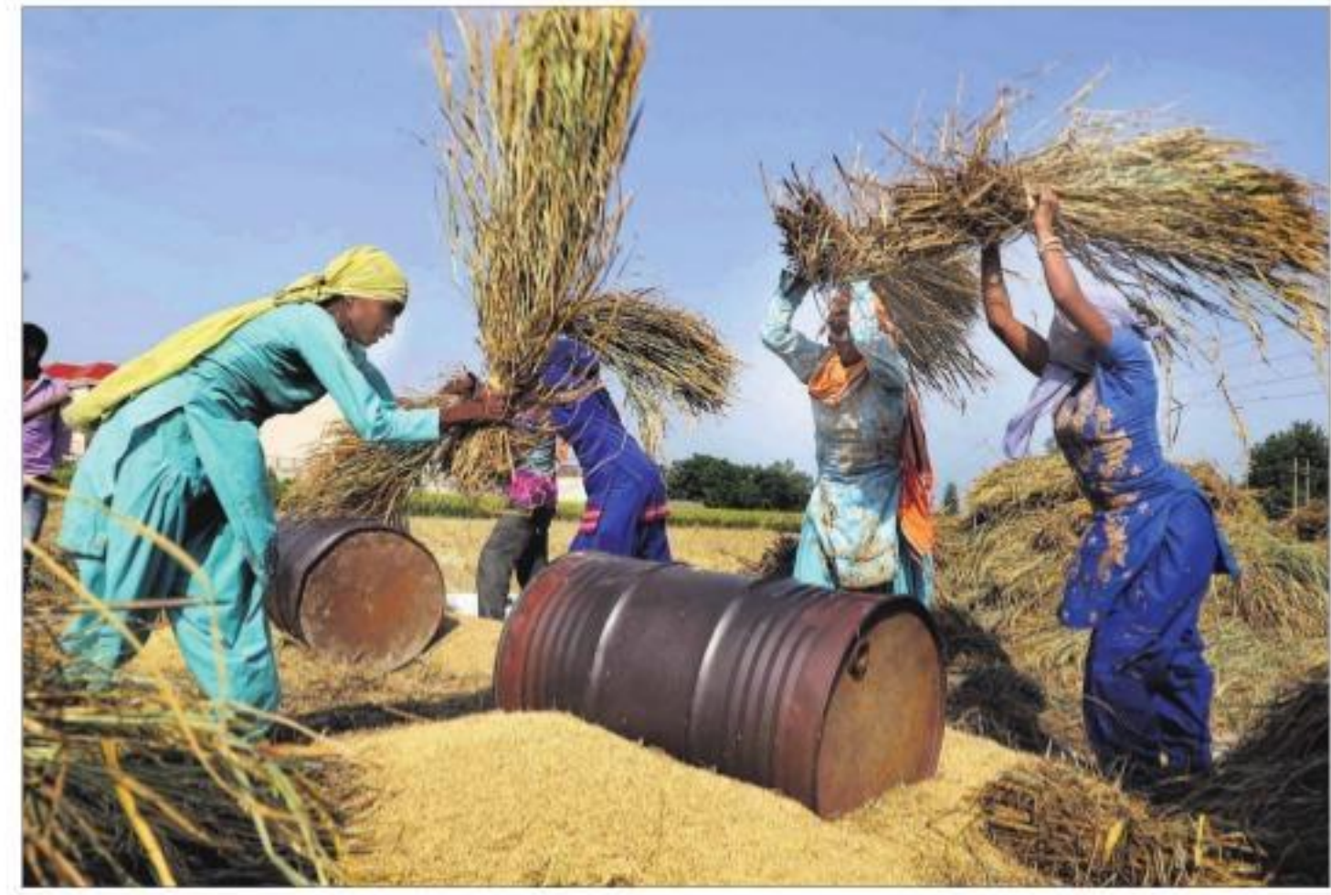
GOLDEN HARVEST Women thresh paddy at a village near Nawanshahr.