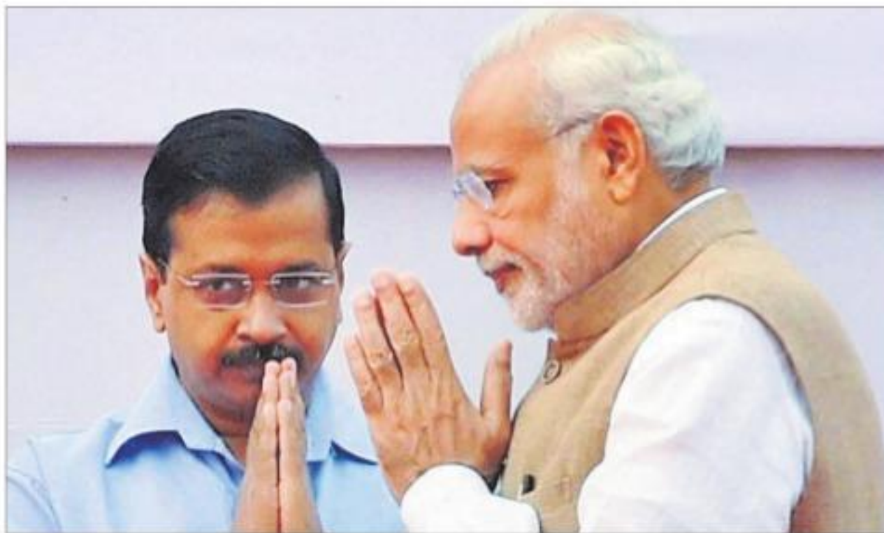
PRAGMATIC: Since AAP's rout in Delhi in LS polls, Kejriwal has been backing Modi.

are already visible. Modi sent Kejriwal a happy birthday letter for the first time this year when the Delhi CM turned 51. It set off an exchange of friendly tweets that had political circles rubbing their eyes in astonishment. Another first was the speed with which the Central government cleared Delhi's proposal for water conservation in the Yamuna floodplains, a sign of the new cooperation movement between Modi and Kejriwal.