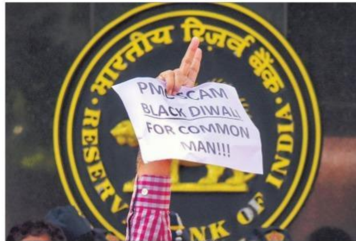
THE BIG QUESTION: What good is RBI supervision, not to speak of an audit by its officials, if it does not have a clue to what is really happening?

What we may be seeing is a vicious cycle at work. The real estate sector, a major client of non-banking financial companies (NBFCs), is in trouble (this predates the NBFC crisis), leading to its players' inability to service their debts, causing the asset quality of their NBFC lenders to decline. This prevents them from accessing funds the way they used to. The Infrastructure Leasing