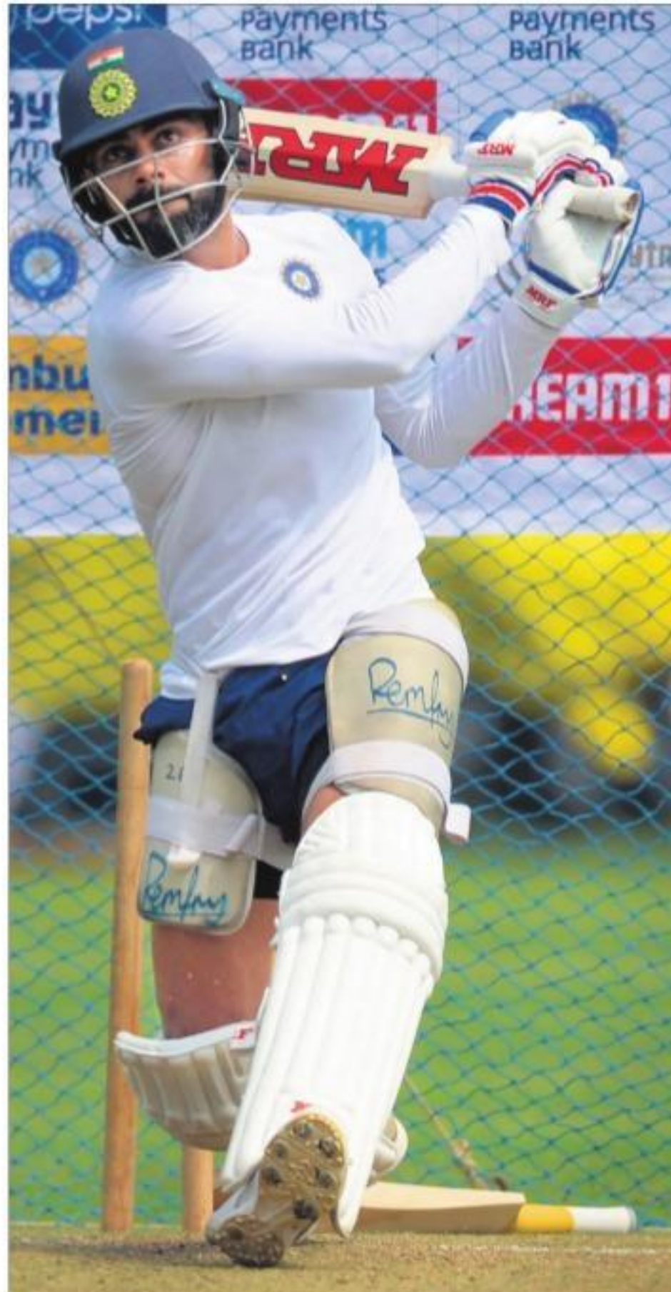
Virat Kohli plays a shot during Wednesday's nets session.