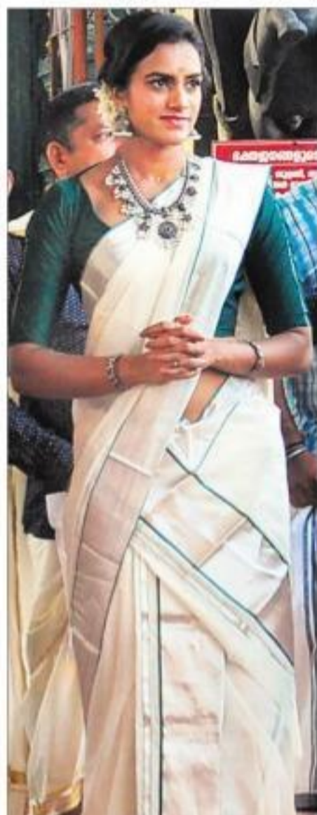
PV Sindhu at the Attukal temple in Thiruvananthapuram.

However, the 24-year-old is committed to improving her performance at the prestigious quadrennial event and turn the silver she won in Rio into gold. "Right now, my focus is on the 2020 Olympics Games and my main aim is to work hard and give my best in Tokyo," Sindhu said during a felicitation by the Kerala government. "My ultimate aim is to get gold. I know it's not going to be easy and I need to work hard," she added.