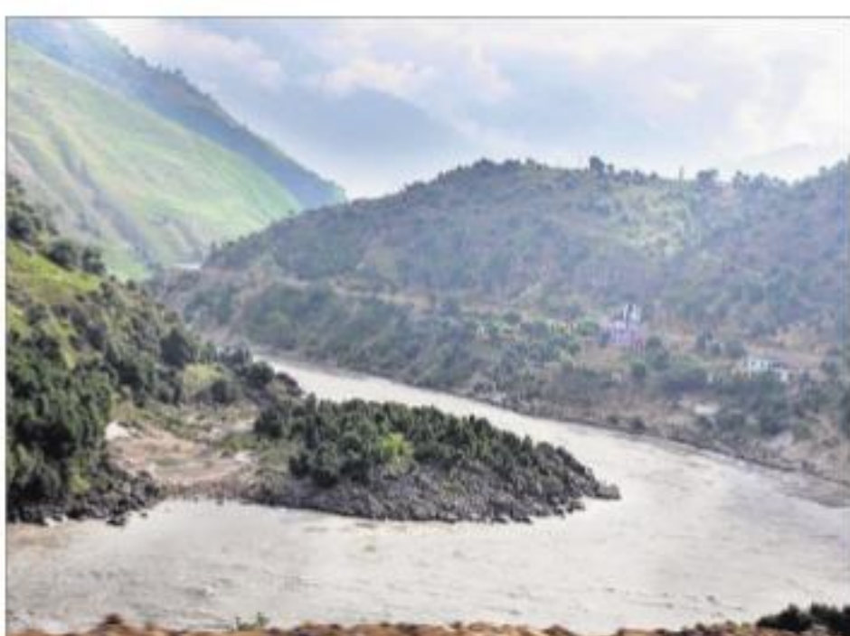
The Chenab water diversion project was first conceptualised in the late 1980s.

After the 2016 Uri terror attack, the Prime Minister Narendra Modi-led Centre had announced speedy clearance and funding for the project and other schemes on western rivers (Chenab,