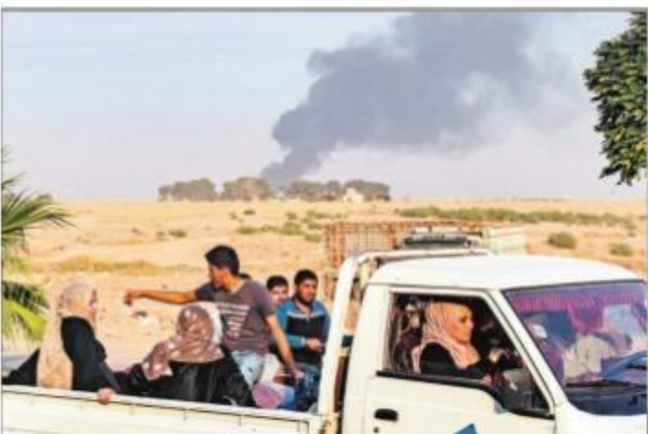
Civilians ride a pick-up truck as smoke billows following Turkish bombardment in Ras al-Ain town of Syria on Wednesday.

TURKEY, OCTOBER 9 Turkish bombardment on Kurdish-controlled areas in northeastern Syria killed at least 15 people on Wednesday, eight of them civilians, a monitoring group said in an updated toll. The Syrian Observatory for Human Rights said at least two of the civilian victims were killed in artillery strikes on the city of Qamishi. Turkey launched its threatened offensive hours earlier, with a limited number of airstrikes and mostly artillery fire across most of the width of its long border with Kurdish-controlled regions of Syria. Several large explosions rocked Ras al Ain, just across the border across from the Turkish town of Ceylanpinar, a CNN Turk reporter said, adding that the sound of planes could be heard above. Smoke was rising from buildings in Ras al Ain, he said.