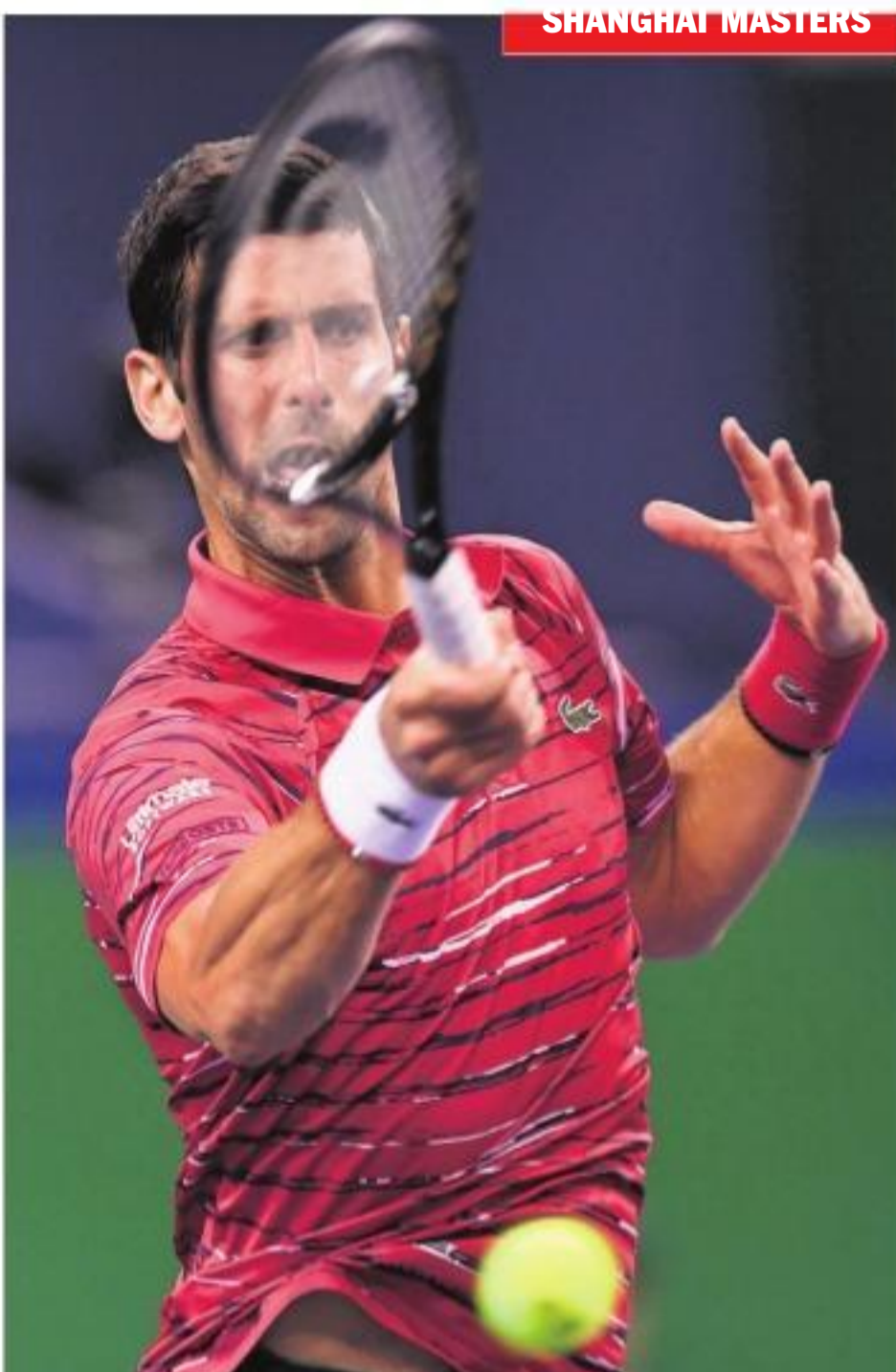
Novak Djokovic makes a forehand return to Dennis Shapovalov.

Greece's sixth seed Stefanos Tsitsipas came out on top in two tiebreaks to beat 47 minutes. The second-set tiebreak had a lighter moment — Zverev losing his grip while hitting a shot, and his racquet flying into the crowd.