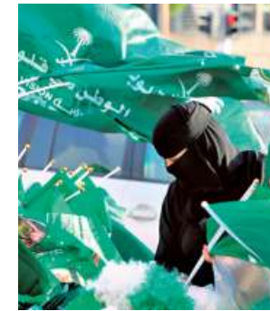
A Saudi woman buying the kingdom’s national flag in Riyadh.

“Another step to empowerment,” the Foreign Ministry wrote on Twitter, adding that women would be able to serve as private first