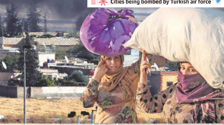
Civilians fleeing Turkish bombardment on Syria’s northeastern town of Ras al-Ain, along the Turkish border, on Wednesday.

What’s the U.S. stand? The YPG was the U.S.’s ally in the war on the Islamic State. But it was Donald Trump’s decision to pull back U.S. troops from Syria that allowed Turkey to launch the invasion