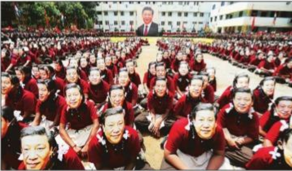
At a Chennai school Thursday ahead of the summit.