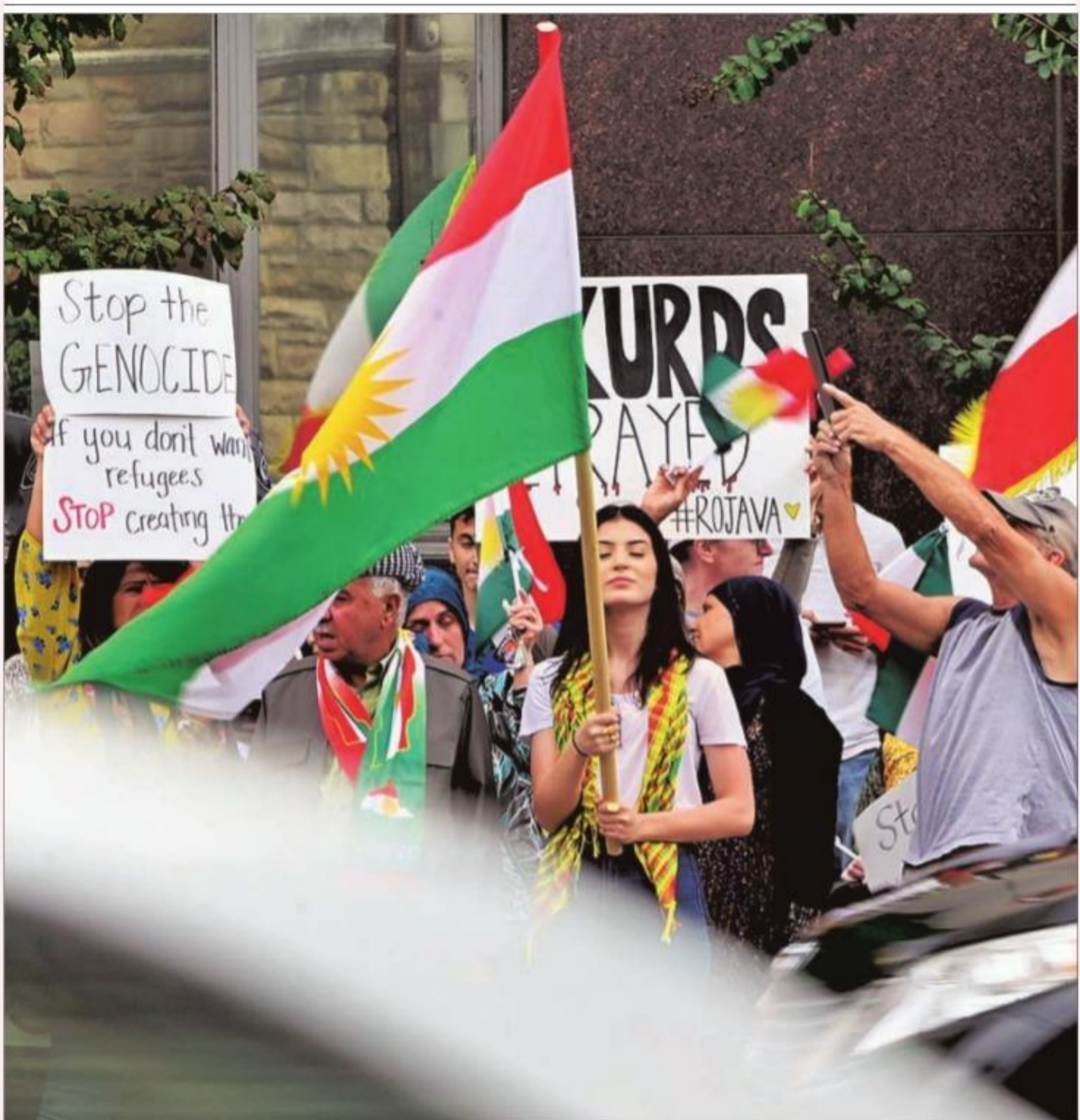
A crowd of over 500 people protest in front of the federal courthouse in Nashville, US, in support of Kurds after the Trump administration changed its policy in Syria

Under Trump, the US becomes the world's fair-weather friend