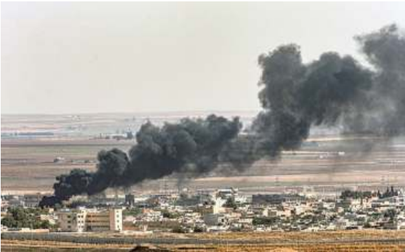
Intensifying offensive: Smoke billowing out after Turkish shelling on the Syrian border town of Ras al Ain.

The twin developments reflected the rapidly growing chaos in Syria in the week since Mr. Trump ordered American forces in the region to step aside, leaving the U.S.-allied Kurds wide open to attack from Turkey. “We have American forces likely caught between two opposing advancing armies, and it’s a very untenable situation,” U.S. Defense Secretary Mark Esper said on CBS’ “Face the Nation”. He did