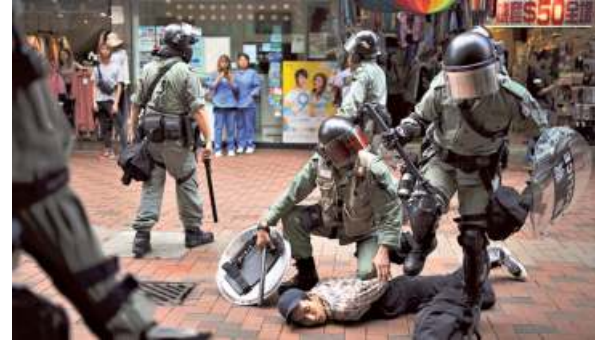
Chaos returns: An anti-government protester is being detained by the police in Hong Kong on Sunday.

Police said an officer was taken to hospital after his