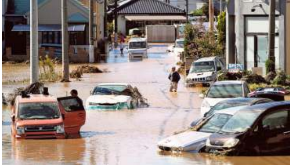
Flooded streets: Vehicles partially submerged after Typhoon Hagibis battered parts of Sano, Japan, on Sunday.

Public broadcaster NHK said 14 rivers across the nation had flooded, some spilling out in more than one spot.