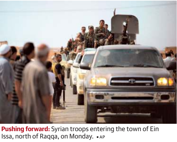
Pushing forward: Syrian troops entering the town of Ein Issa, north of Raqqa, on Monday.

grasp. Under their deal with the Kurds, government forces are poised to move into border areas from the town of Manbij in the west to Derik, 400 km to the east. Syrian state media reported that troops had already entered Tel Tamer, a town on the strategically important M4 Highway that runs east-west around 30 km south of the frontier with Turkey. State TV later showed residents welcoming Syrian forces into the town of Ain Issa, which lies on another part of the highway, hundreds of km away. Ain Issa commands the northern approaches to Raqqa, former capital of the Islamic State "caliphate", which Kurdish fighters recaptured from the militants two years ago in one of the biggest victories of a U.S.-led campaign. Much of the M4 lies on the southern edge of territory