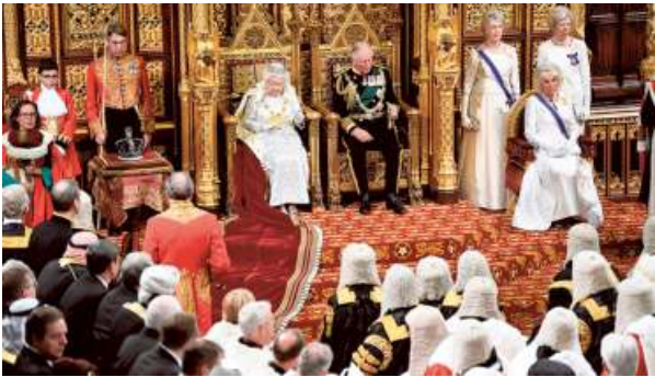
Plan of action: Queen Elizabeth II delivering a speech during the State Opening of Parliament in London.

AGENCE FRANCE-PRESSE LONDON British Prime Minister Boris Johnson on Monday set out his government's priorities at a parliamentary ceremony full of pomp and pageantry attended by the Queen, with Brexit top of the agenda.