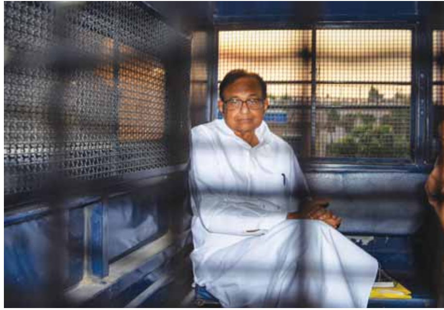
Senior Congress leader and former Finance Minister P Chidambaram after being produced in the Rouse Avenue Court in connection with the INX Media corruption case in New Delhi on Tuesday