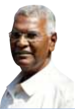
CPI general secretary —D Raja

It is biggest irony of our times that while we are celebrating Gandhiji's birth centenary, the BJP is seeking Bharat Ratna for Savarkar, an accused in his assassination case.