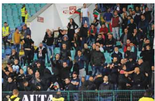
Bulgarian fans gesture as they stand in the stadium to watch the Euro qualifier

"We made the decision at half-time to come out and play the game which we thought was