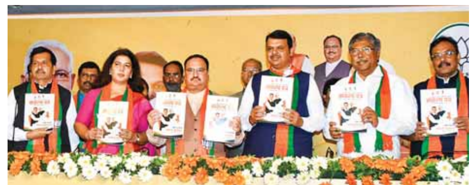
Maharashtra Chief Minister Devendra Fadnavis, BJP working president JP Nadda, State BJP president Chandrakant Patil and other leaders release BJP's manifesto ahead of Maharashtra Assembly elections in Mumbai on Tuesday

Releasing "Sankalp Patra" along with the party's working president JP Nadda, Chief Minister Devendra Fadnavis said, "On our return to power in the State, we will recommend to the Centre a proposal to bestow 'Bharat Ratna' upon social reformers Jyotiba