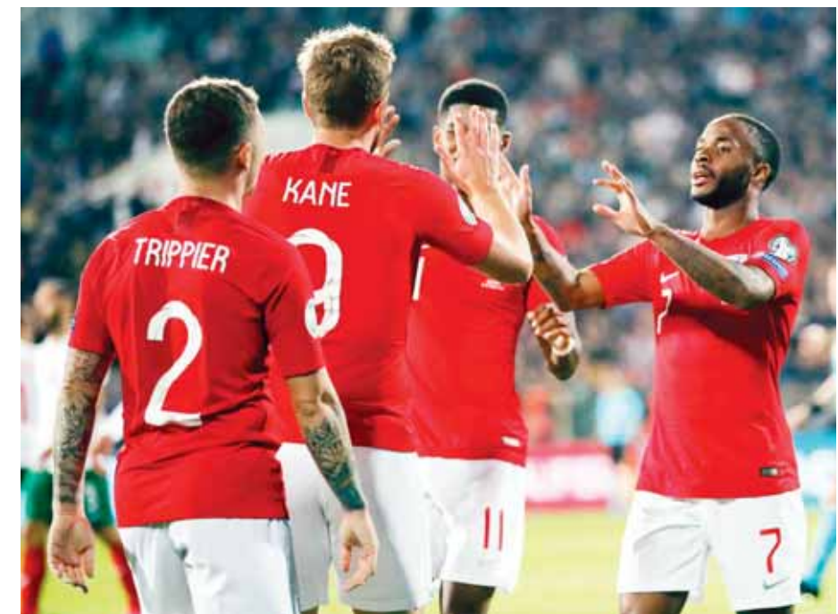
Raheem Sterling, right, celebrates after scoring his side's fourth goal during the Euro 2020 group A qualifying match

England players suffer shocking abuse; Monkey chants at Sterling & Rashford; Bulgaria fans make fascist salutes; Match stopped twice & almost abandoned