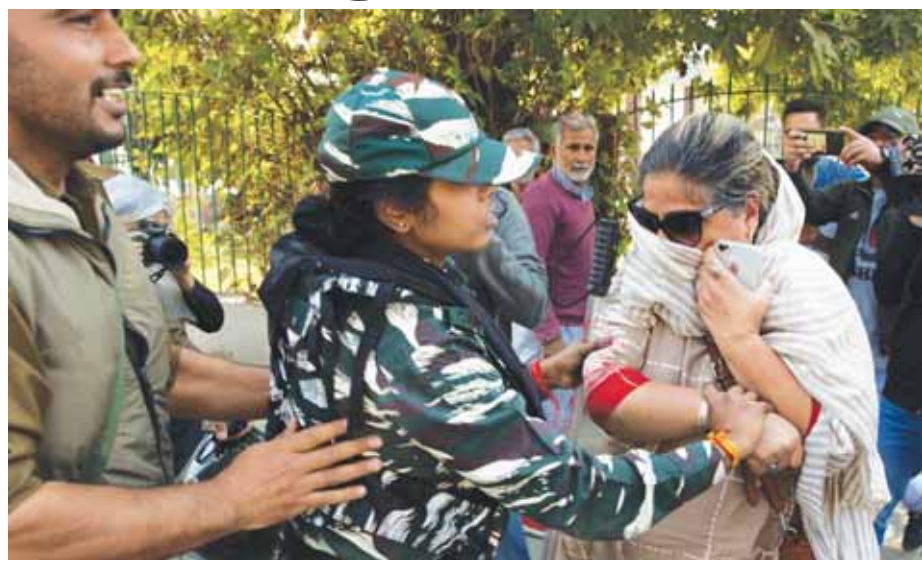
A paramilitary woman detains a Kashmiri woman who was among the protesters in Srinagar on Tuesday