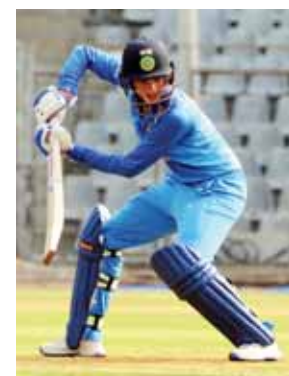
Smriti Mandhana in a file picture

Among others batters, skipper Mithali Raj moved down to the seventh spot while her Harmanpreet Kaur rose in the rankings to the occupy the 17th place.