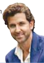
Actor —Hrithik Roshan

Professionally, it has been a very special year for me. Both the successes have only motivated and encouraged me to keep following my instincts and work hard.