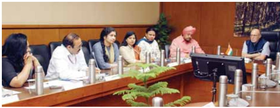
L-G Anil Bajjal chairs a meeting attended by Mayors of three municipal corporations and commissioners in New Delhi on Tuesday

Lieutenant-Governor (L-G) Anil Bajjal on Tuesday approved 'online module' to sanction building plan for up to 500 sqm for low-risk residential buildings under 'Unified Building Bye Laws 2021'. With the move, the residents of the national Capital are no longer needed to visit offices of the civic agencies to submit their applications for building plan. The building plan is in the form of digitally signed letter which can be downloaded by the applicant or the architect through online mode also.