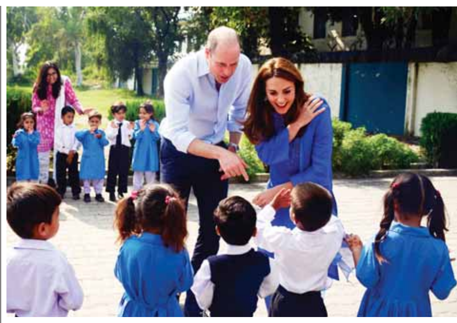
Britain's Prince William and his wife Kate interact with students during their visit to a school outside Islamabad, Pakistan on Tuesday

Tal Tamm (Syria): Kurdish forces held out in a key border town Tuesday seven days into a deadly Turkish invasion of northeastern Syria that has caused mass displacement and reshaped the political map.