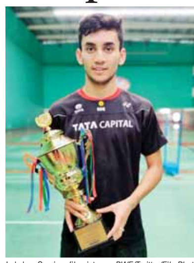
Lakshya Sen in a file picture

Lakshya will play the Saarlouis Open Super 100 (Oct 29-Nov 3) next, before participating in two International Challenge events at the Irish Open (November 13-16) and Scottish Open (Nov 21-24). He will also play the Syed Modi International Super 300 (Nov 26-Dec 1).