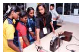
Faculty briefing the students about projects

A total of around 14 labs were set up with various kinds of instruments, prototypes and equipment to help students understand the intricacies of electronics and instrumentation engineering. A few of these dis-