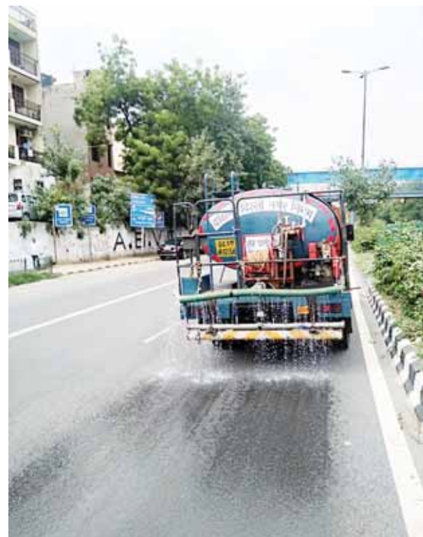
Water being sprinkled in SDMC area

There has been a sudden increase in the snatching cases in the recent past. The Delhi Police have claimed that they have managed to curb cases of snatching and more than 4,000 criminals have been put behind the bars.